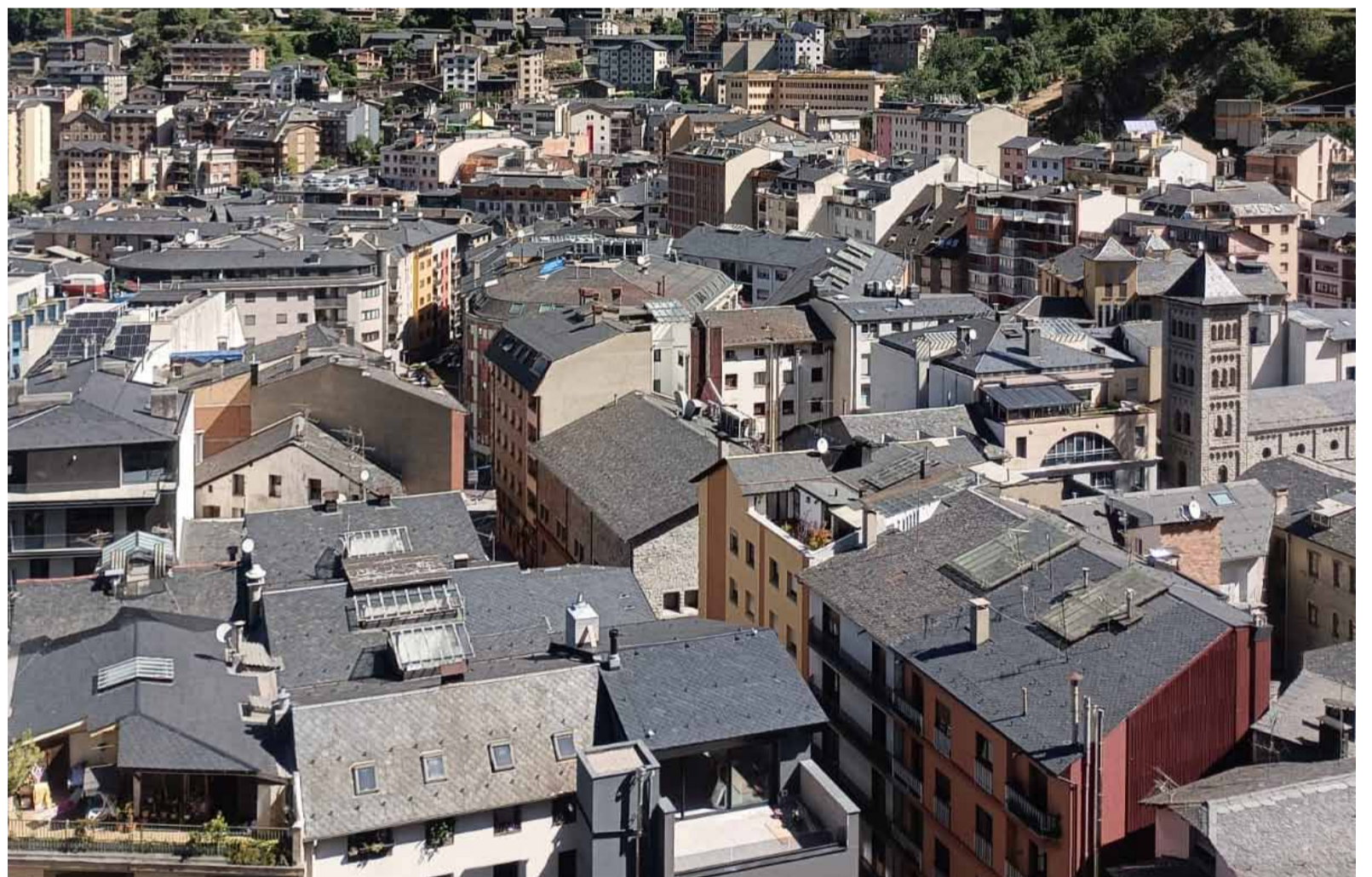
Image of the parish of Escaldes-Engordany.