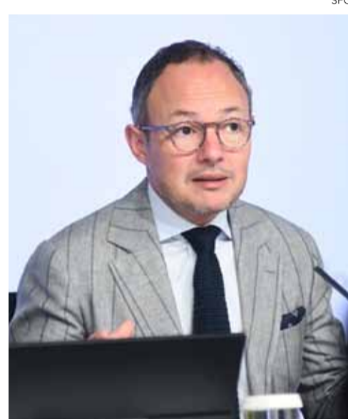
The Head of Government, Xavier Espot, during the presentation of the Omnibus Bill.

The Head of Government, Xavier Espot, clarified a series of concepts around the vignette that would be charged to foreign vehicles. Thus, he remarked that the decision to implement this system «is not firm at all», since it must be agreed with «the economic and social agents» and added that this «joint reflection» will have to take place until at the end of the year to finally decide whether it finally goes ahead or not. In any case, he pointed out that this tax would only be charged to excursionists, that is, people who enter and leave the country on the same day and in no case to tourists or cross-border workers. In the case of tourists, Espot stated that they would already pay the tourist tax and, therefore, would be exempt from paying the vignette, in addition to categorically denying that this pay-