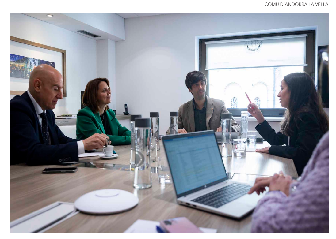
The meeting that took place between the consuls of Andorra la Vella and those of Escaldes-Engordany.

The purpose of the signage is to prevent vehicles from parking there to improve traffic by preventing traffic jams in the area and guaranteeing the safety of pedestrians.