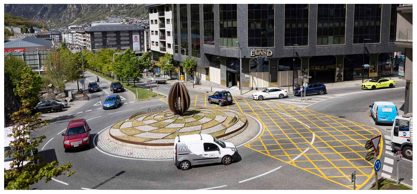
The action that took place at the KM0 roundabout.

The authorities have highlighted the good harmony and readiness to carry out the strategic plan of collaboration with the purpose of ensuring the wellbeing and quality of life of the ci-