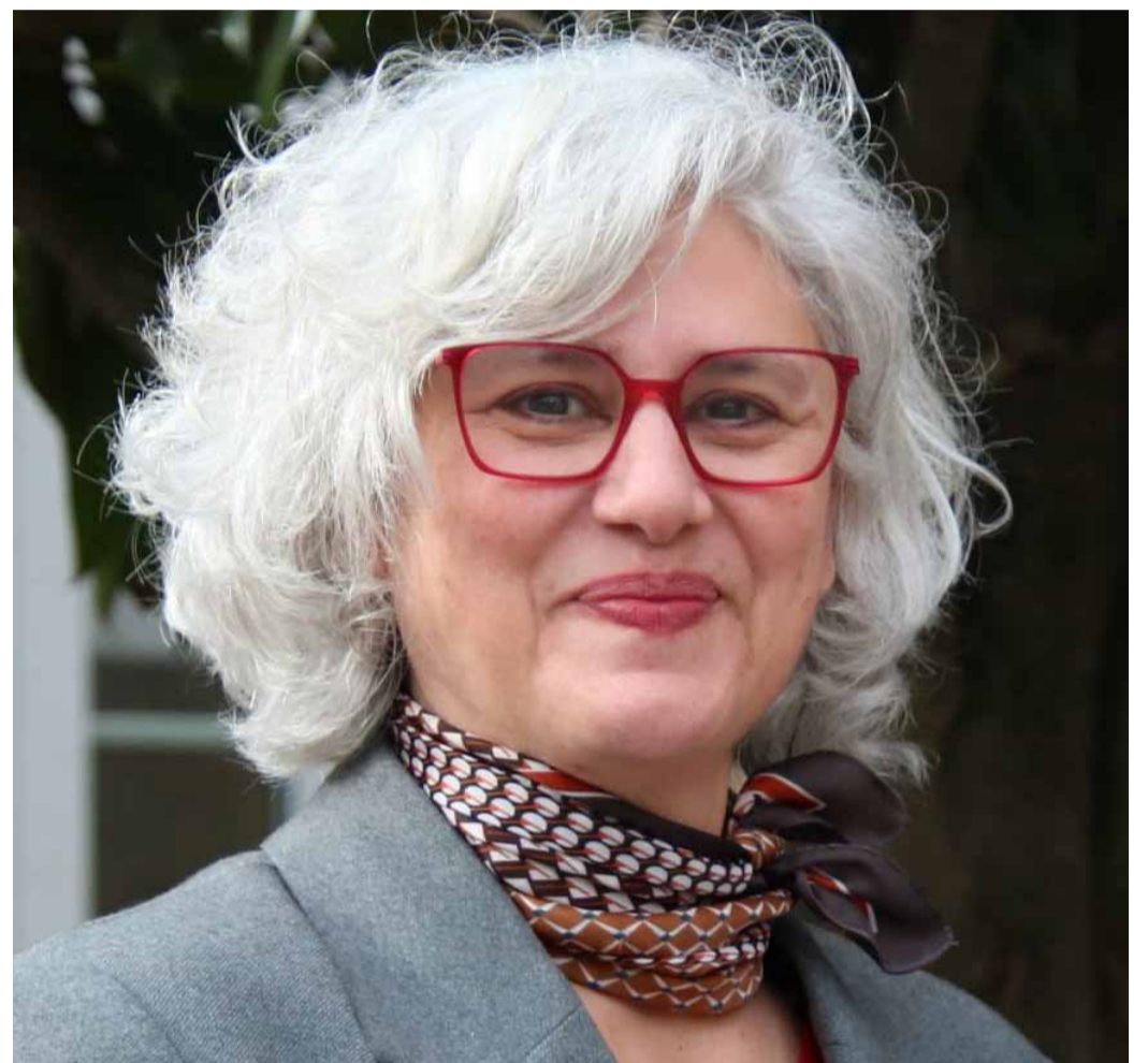
AJUNTAMENT DE FOIX

The business parks developed at the town's entrances are home to shops and craft industries, as well as Vitesco, which produces calculators for car engines and