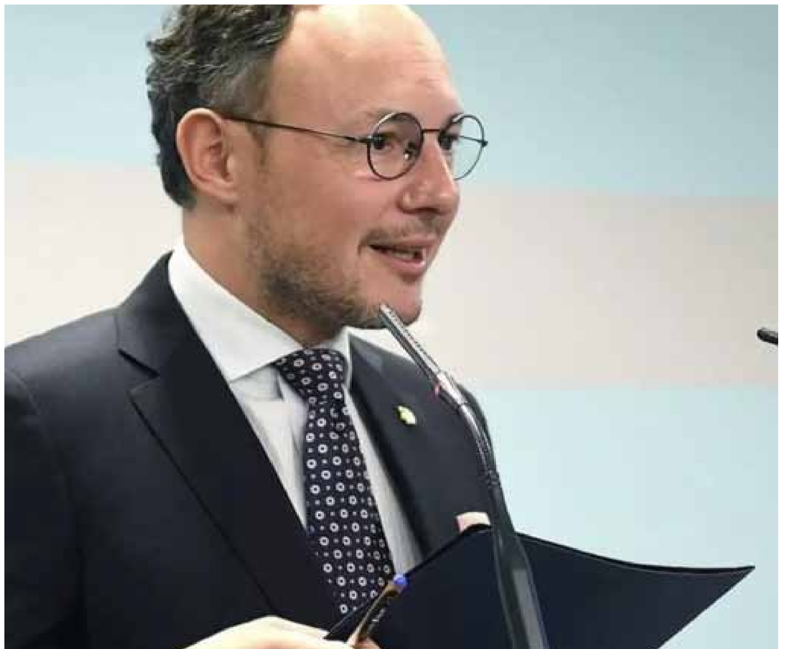
The head of government, Xavier Espot.