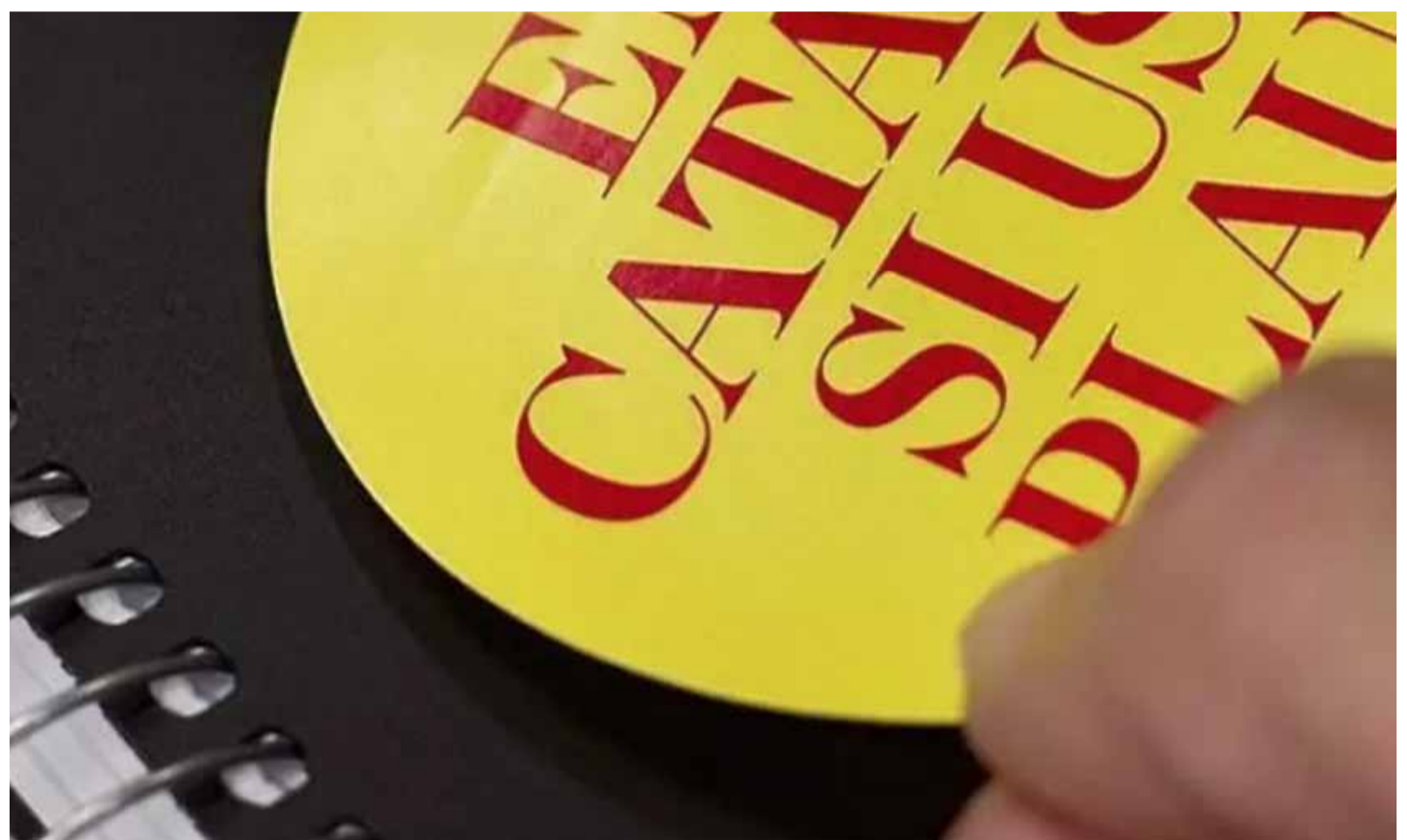
Agreement between the parliamentary groups for the Catalan language bill.

The legislative commission for Education, Research, Culture, Youth and Sports closed this Thursday the text of the bill for the own and official language, which has been worked on intensively and in detail in recent weeks. Precisely this work, together with a prolific debate carried out on all points of the law, has made it possible to conclude an agreement that has the consensus of the Demòcrats, Concòrdia, PS and Ciutadans Compromesos parliamentary groups. In this way, it is expected that the bill can be approved with a clear majority next Thursday, April 25th. With regard to the accreditation of a minimum level of Catalan to renew the residence and work permit, one of the points that has generated the most interest in the law, it has been agreed that it is compulsory to take a Catalan course of 30 hours in order to obtain the renewal,