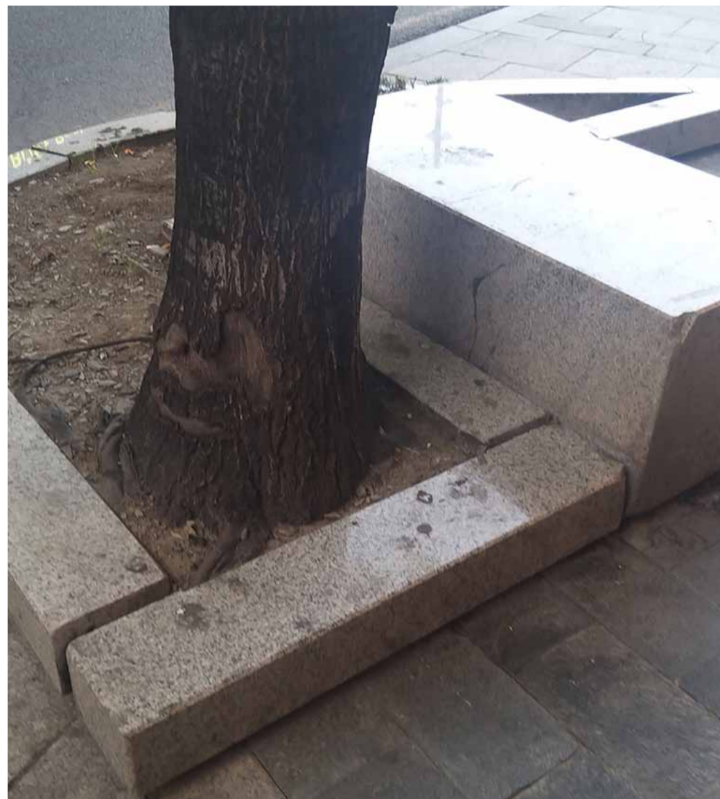
The granite around the trees in Prat de la Creu that the municipality wants to replace.

Thus, according to details from the Municipality, the intention is to «tear off all areas of green slate pavement», specifically 42 (the ones in front of each tree), sin-