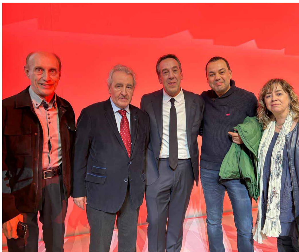
Image of the Progressists-SDP delegation in Labège.