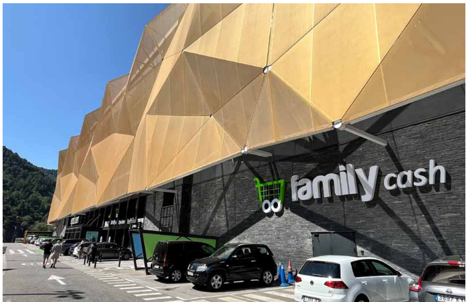
The facade of Epizen with the Family Cash sign.