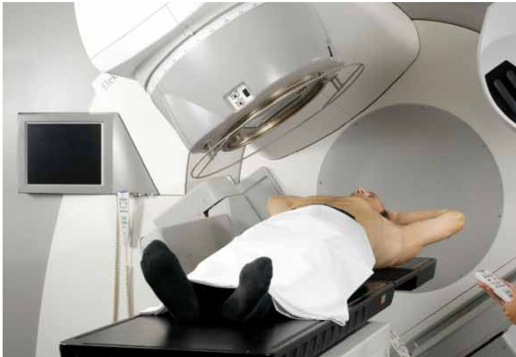
A man undergoes radiotherapy treatment.