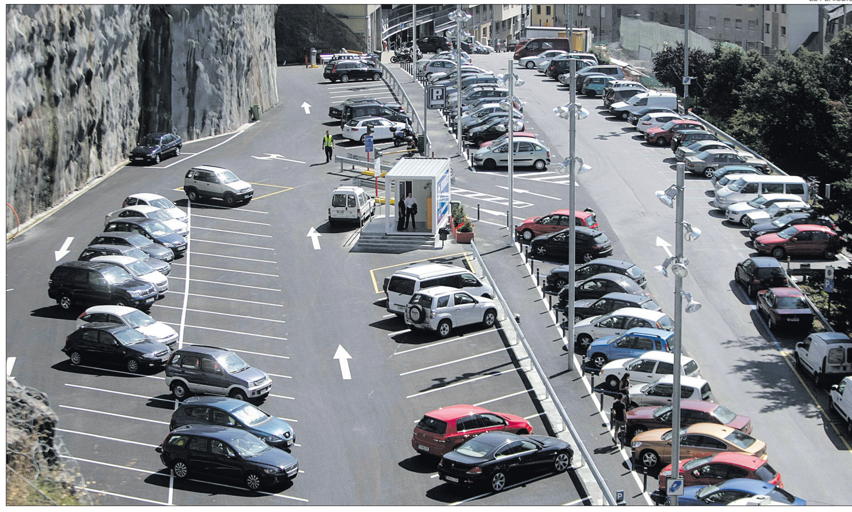
►► Cars in a parking lot in Andorra.

Regarding the type of energy, last year practically all groups of vehicles showed positive variations compared to the previous year. As for the most numerous, the group that increases the most is gasoline (representing 49% of vehicles), with 1,502