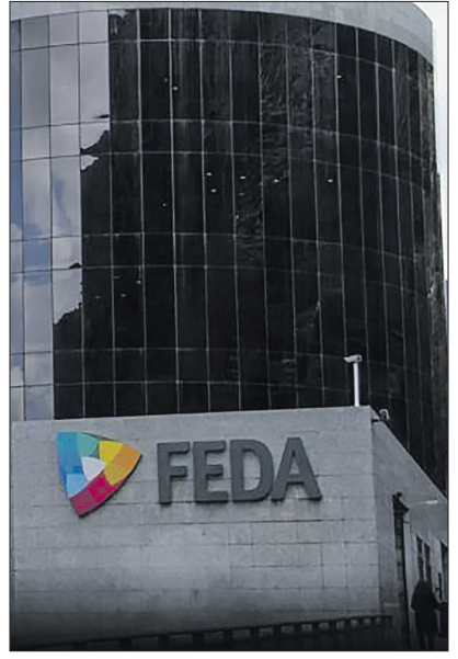
▶▶ FEDA building.

With respect to the data accumulated over the last twelve months, consumption has been 564,269.6 MWh, which represents an increase of 4.2% compared to the same previous period. Of this consumption, 462,565.5 MWh have been imported, which reflects a positive interannual variation of 6.5%, while 101,734.3 have been produced in the country, 5.4% less than in January 2022. ≡