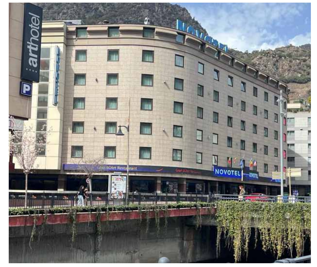
Archive image of hotels in the parish of Andorra la Vella.

As for the Hotel Anyós Park, located in the parish of La Massana, from Thursday to Sunday they have an average of 86% occupancy, a figure that drops considerably compared to Monday, when the number of reservations they