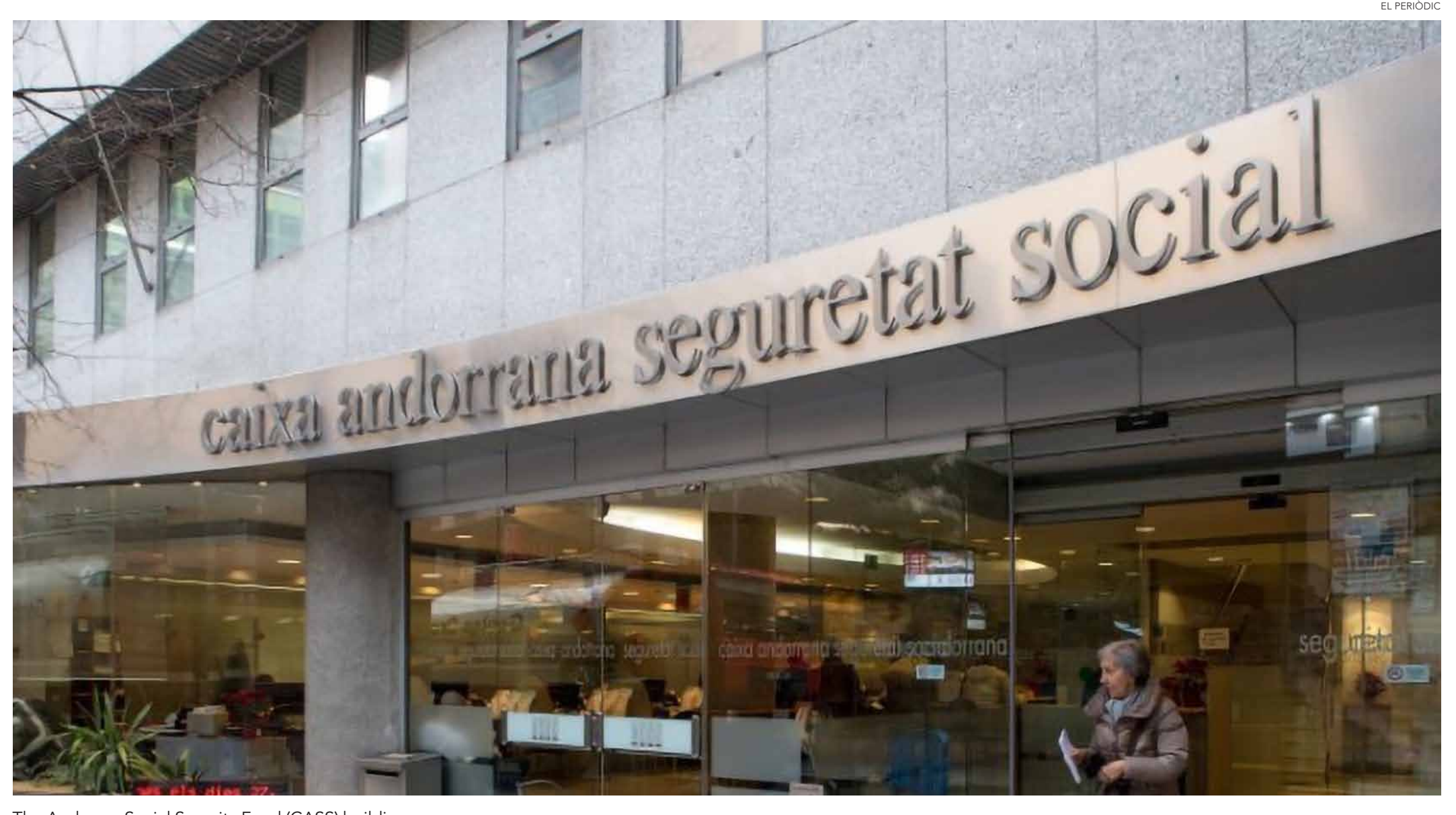
The Andorran Social Security Fund (CASS) building.

Expenses relating to the benefits of the general branch increase by 7.9%