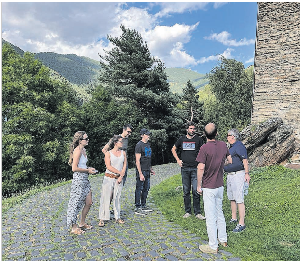
► Image of the members of the citizen platform 'Participa'.

As for the measures they propose to slow down or try to reverse the situation if possible, first of all,