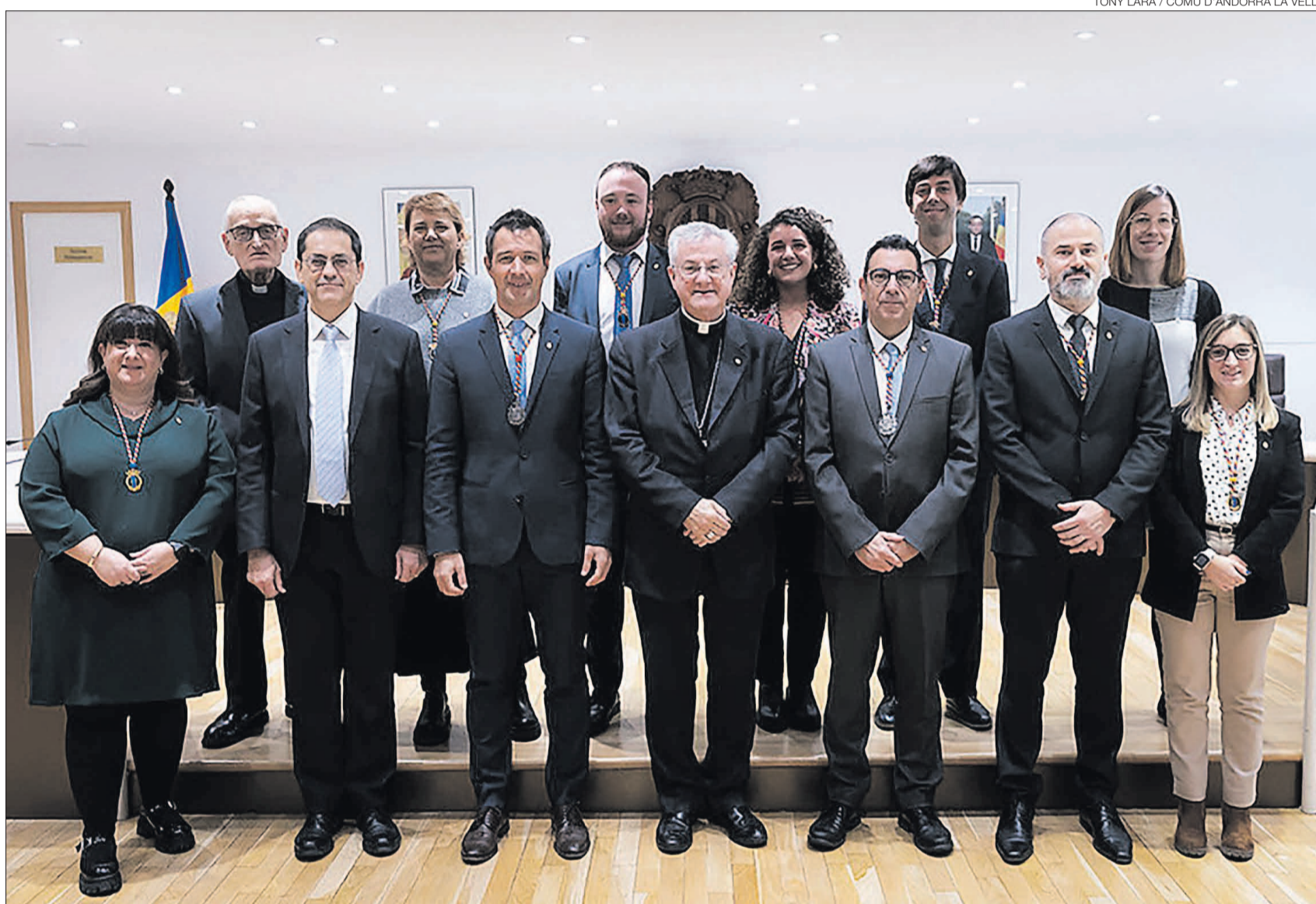
►► The episcopal co-prince, Joan-Enric Vives, last Thursday with the councilors of the Municipality of Andorra la Vella.