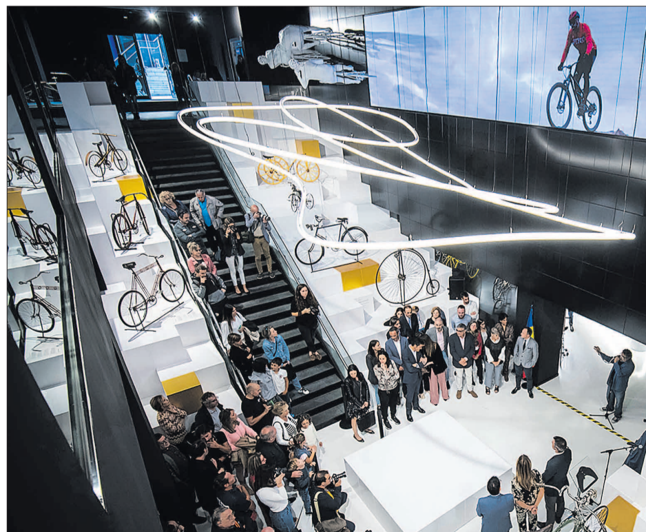
►► The Bici Lab, during a reception of La Vuelta stage.