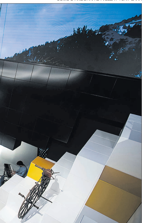
COMÚ D'ANDORRA LA VELLA / TONY LARA