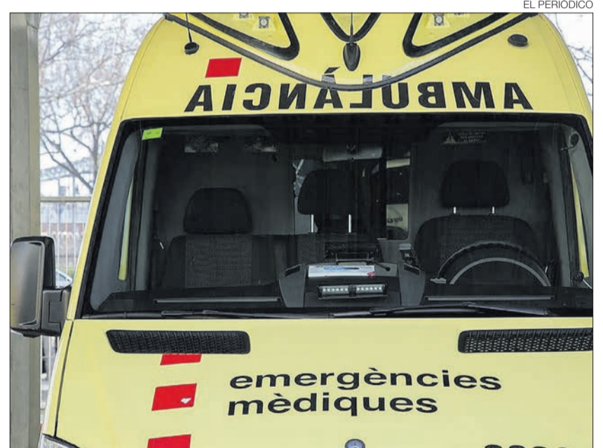
►► Archive image of an EMS ambulance.