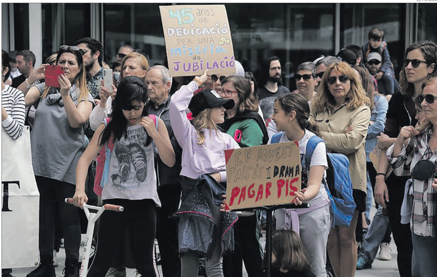
► Different people in last year's Workers' Day demonstration.