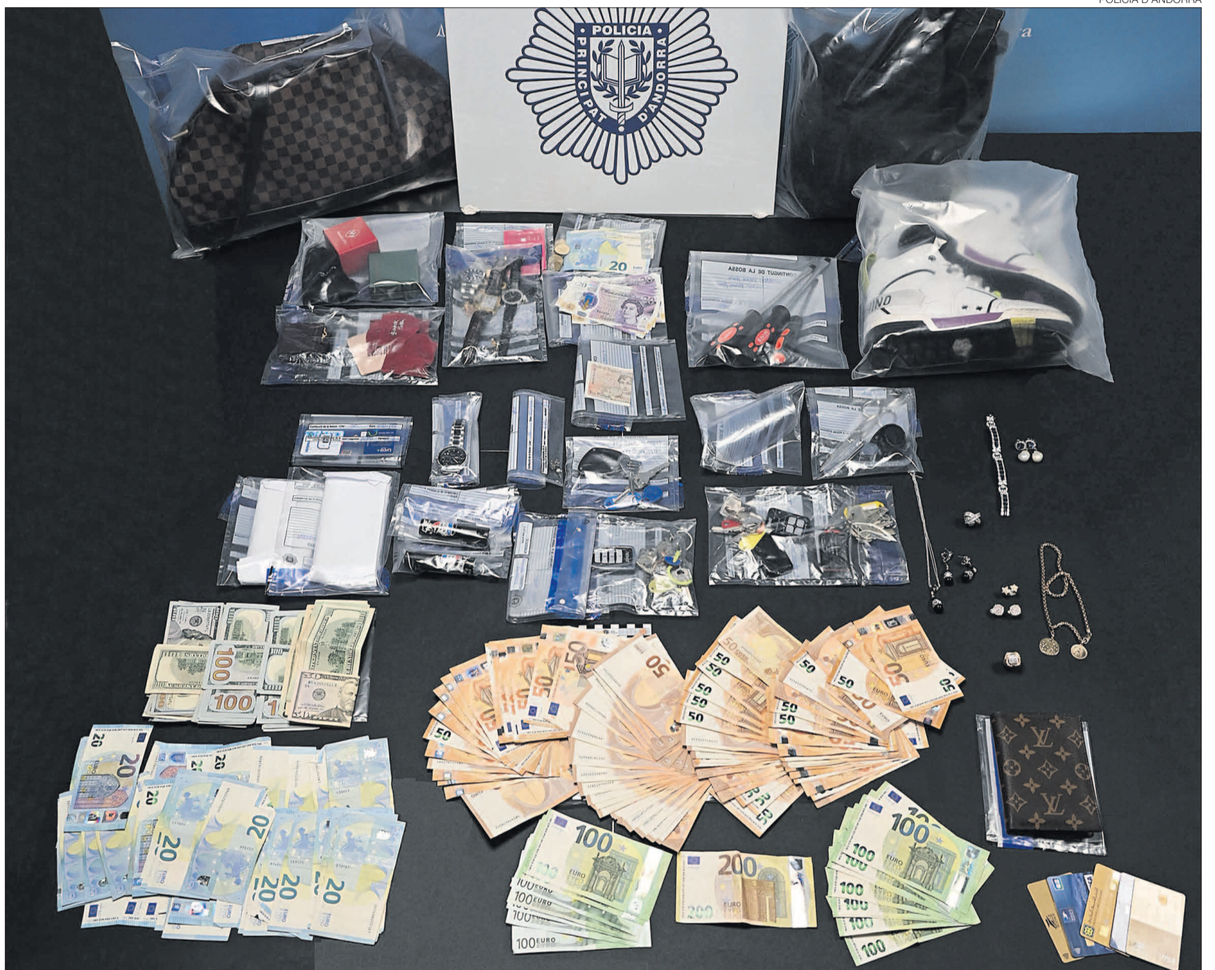
► Picture of the loot.

Specifically, an initial financial loss of around 100,000 euros is