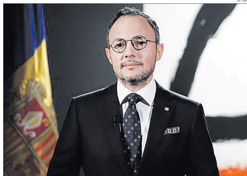
► The Head of Government, Xavier Esport, during his New Year's message.

3,1% the Consumer Price Index (CPI) of Spain