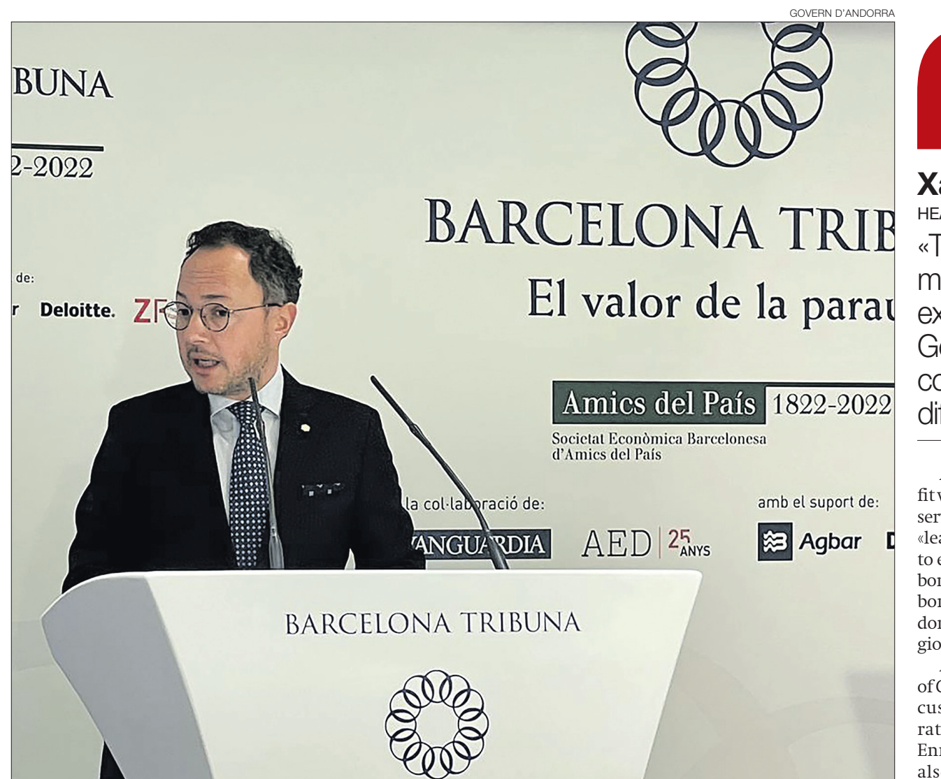
►► The Head of Government, Xavier Espot, in his conference in Barcelona, last Thursday.

vable figures with moderate rates or the entry into the International Monetary Fund: «The model of success that I am coming to explain to you, which allows us to be the second fastest growing economy in Europe in 2022, is not the exclusive merit of this Government, it is the result of a collective effort of four governments of a different political sign», pointed out the highest representative of the Executive. In this sense, «with the process of economic opening, the diversification of the country also came: the hotel, restaurant and leisure offer is more robust; the financial sector, which has undergone a profound paradigm shift, remains a solid pillar of our economy», he recalled.