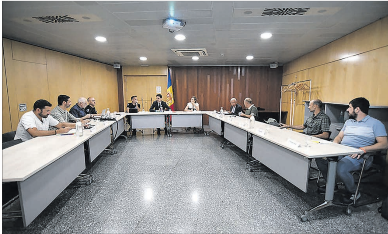
► Image of the meeting of the Hunting Monitoring Commission.

EL PERIÒDIC ESCALDES-ENGORDANY @PeriodicAND