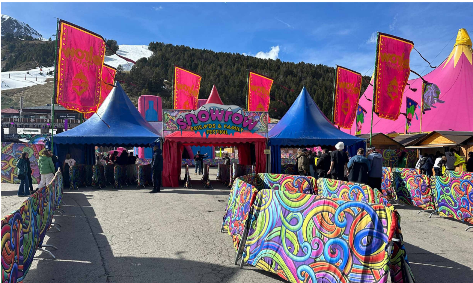
The entrance to the festival area, yesterday at noon.