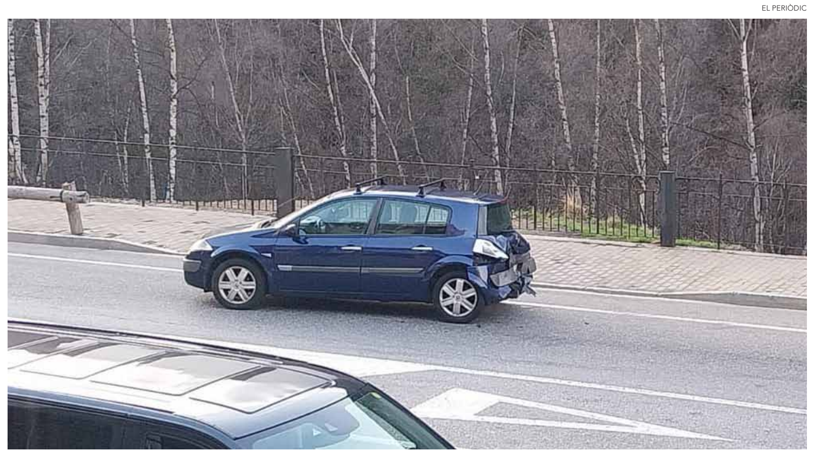
An image of the parked car that the Opel Corsa ran into.

The driver of an Opel Corsa car with Spanish license plate caused an accident in Canillo yesterday morning. According to the indications, the driver would have lost the control of the car and it collided with another vehicle parked in one of the streets of Ransol and then he fled. The events took place yesterday around 08:00 am and, once the officers arrived at the scene, they had to partially block the road and control traffic. However, hours later the Andorran Police found the vehicle, but without anyone inside. Currently, the police force is