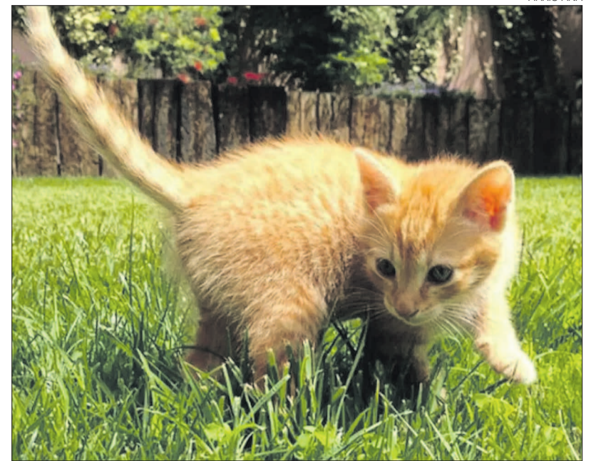
►► A kitten.