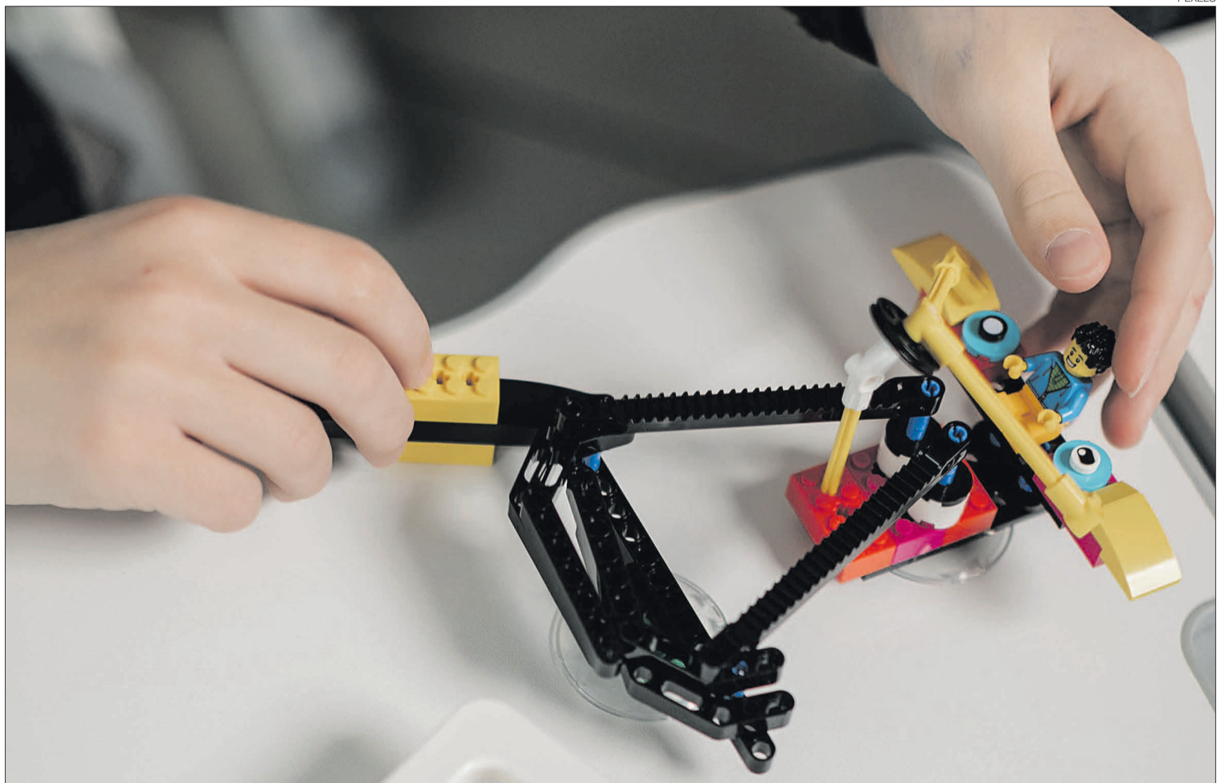
► Image of a child playing with a Lego.