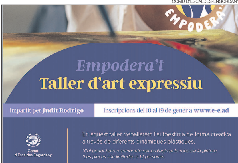
►► Informative poster of the activity organized by the municipality of Escaldes-Engordany.

which will last two hours, will take place on Saturday, January 20th and will take place in the crafts room of the retirement home. Registrations can be made from January 10th to 19th this year through the website www.e-e.ad or in person at the Department of Social Action, from Monday to Thursday from 08:00 to 13:30 and from 14:30 to 4:30 p.m. and Friday from 12:00 a.m. to 3:00 p.m. Places are limited to 12 people and the price of the activity is five euros. ≡