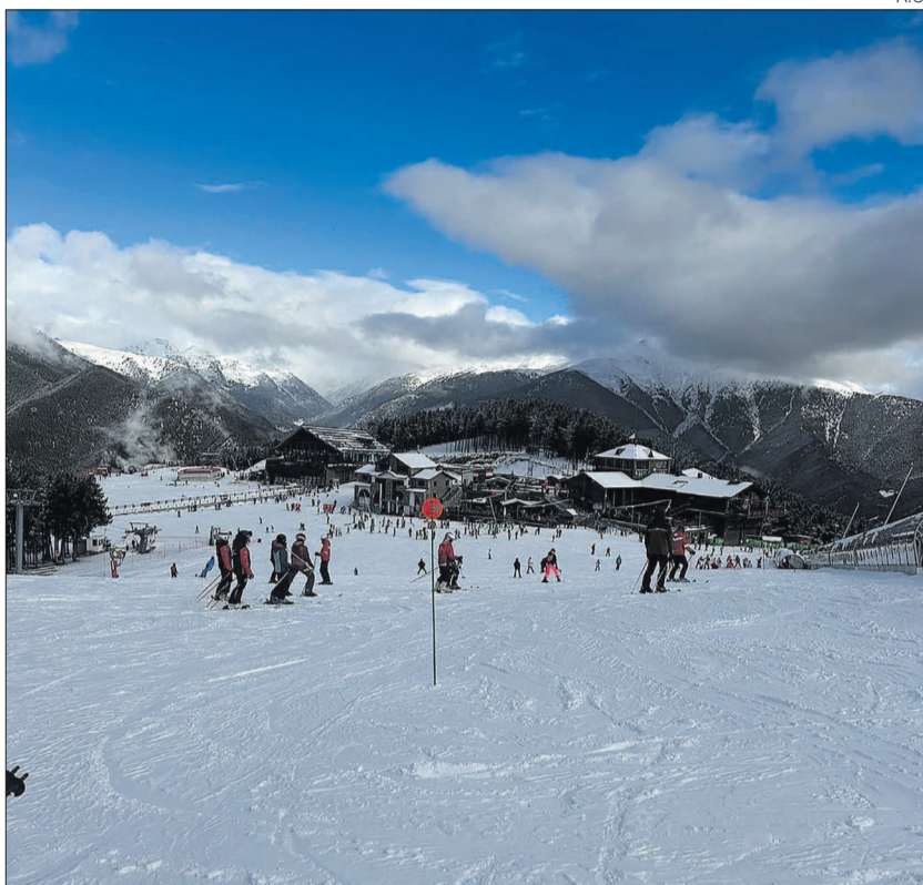
►► Image of a ski slope.

On the other hand, during the afternoon there was heavy traffic