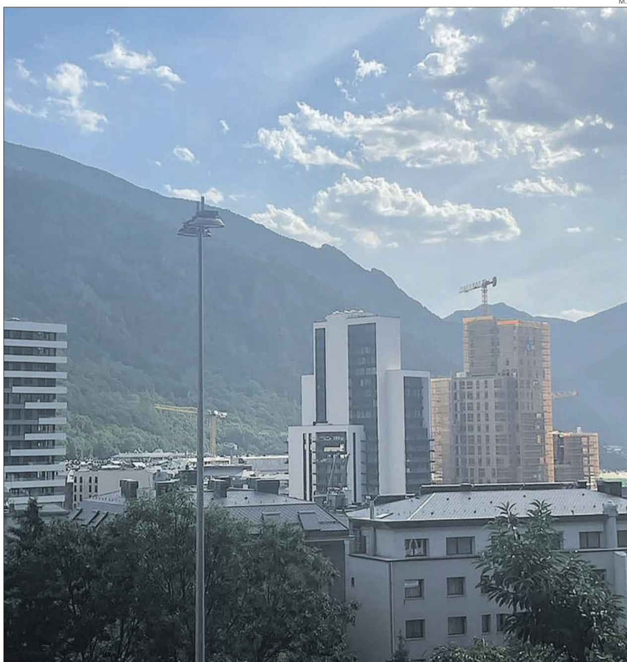
►► Image of the towers of Escaldes-Engordany.