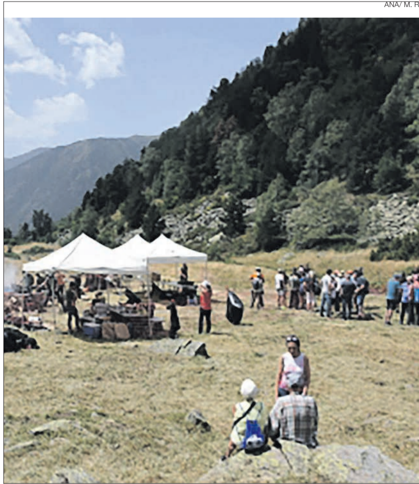
►► The feast of the blessing of cattle in the Rialb valley.