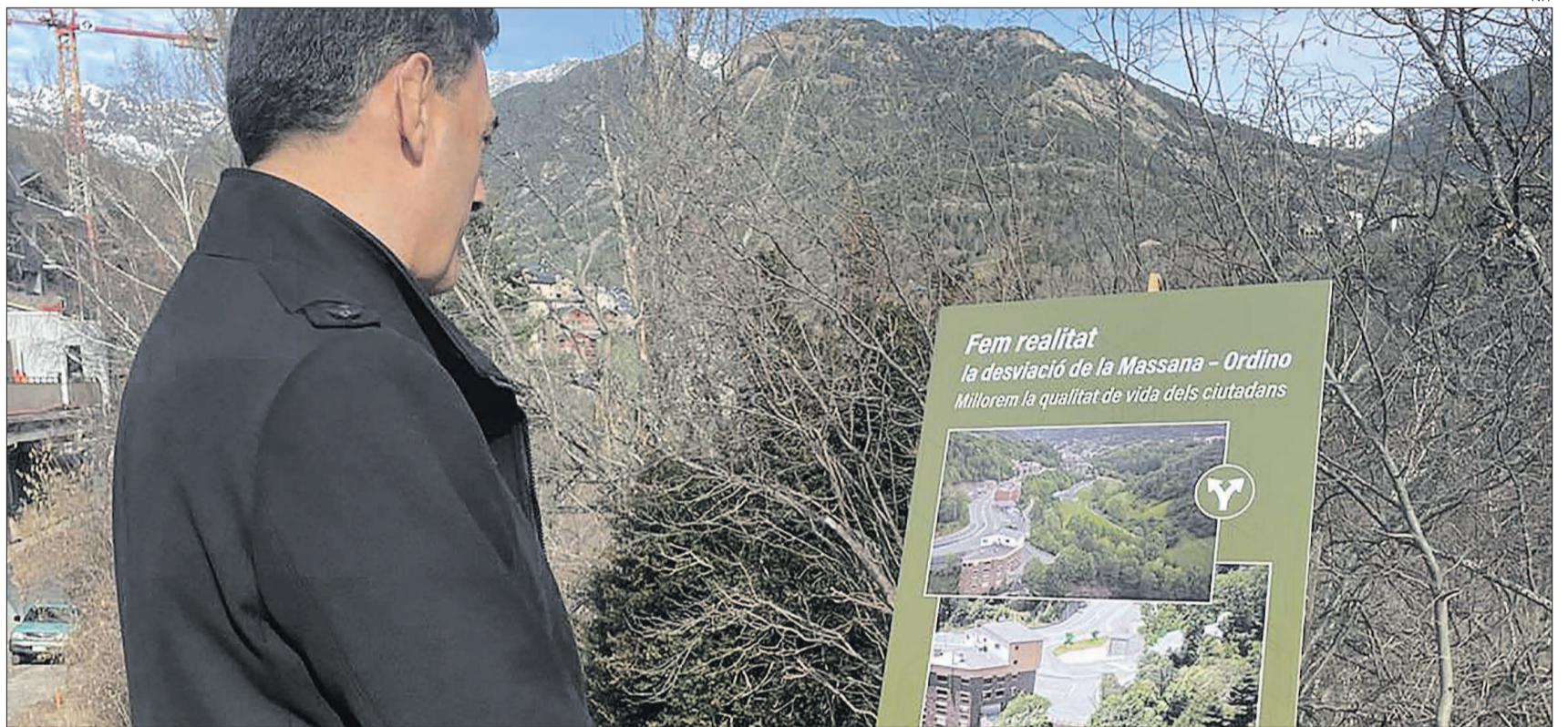
► The Minister of Territory and Urbanism, Raul Ferré, in front of the point where the new La Massana road starts.

Farré also commented that with the aim of speeding up the works, as the construction phases progress, the next ones will be tendered and awarded in order to «advance the work quickly». It is expected that the construction will be completely completed by the middle or end of 2027 and the minister stated that «we will now award the second phase and by spring we