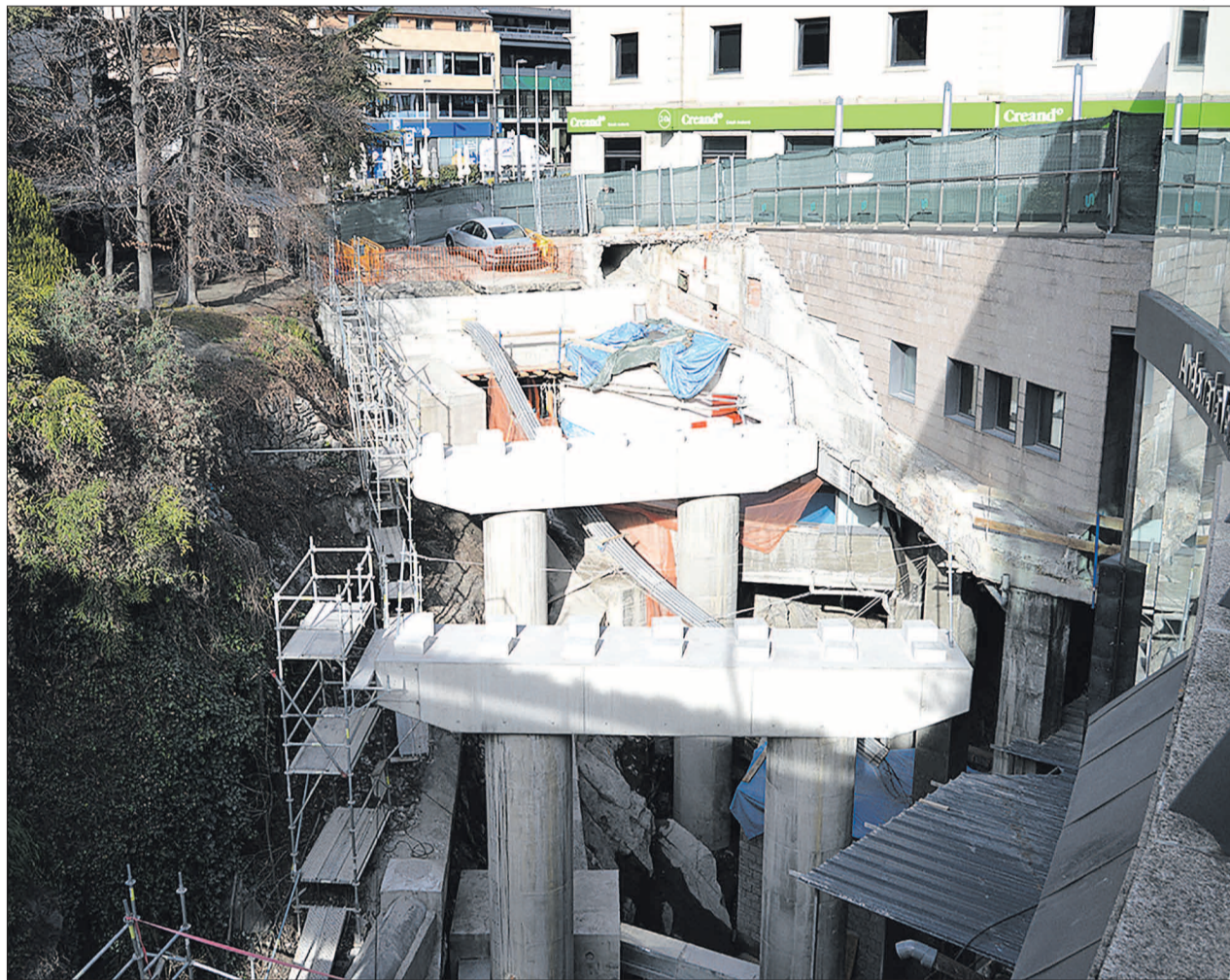
► The current appearance of the works on the Doctor Vilanova viaduct.

After the placement of the beams, concrete slabs will be installed that will serve as formwork for the viaduct's top, work that will be done with a smaller crane, but which will also affect vehicles