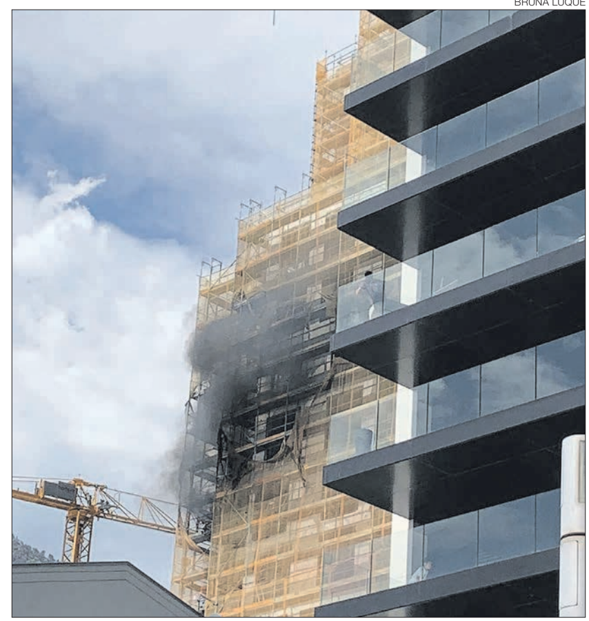
▶▶ Imatge de l'edifici incendiat.

scaldes-Engordany had a scare last Friday at noon after one of the towers under construction caught fire. Specifically, it is the twelfth floor of the Clot d'Emprivat area, and according to a hypothesis from the Fire Brigade, the fire could have started in a bucket of the same building, since it contained insulation material or a small short circuit that was made by manipulating some tool. The head of the Fire Department, Marc Roger, commented that the entire protective grid of the work was burned, which forced it to be completely evacuated. The workers who were working were quickly evacuated as a precaution. In order for the fire brigades to work better, the Police and the municipal traffic ser-