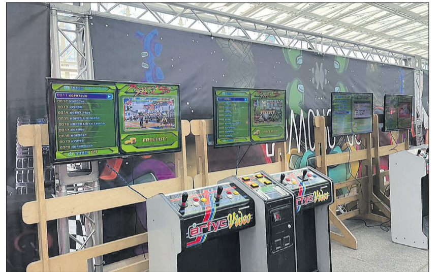
►► The Videogames Show opens its doors from last Friday until tomorrow afternoon, with games for all audiences.