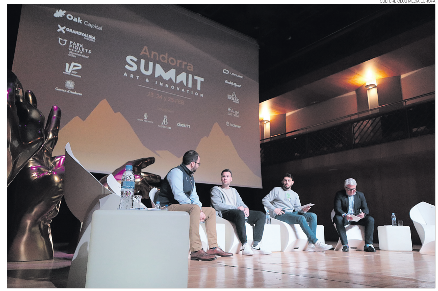
►► Hardfork Project Day at one of the Summit Art & Innovation conferences.

Next year there will be more languages and it will || The Principality is "attractive" for companies that handle cryptocurrencies or the blockchain