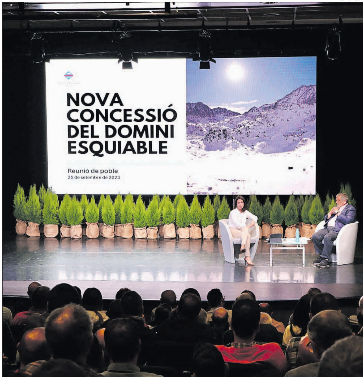
►► The town meeting last Monday.