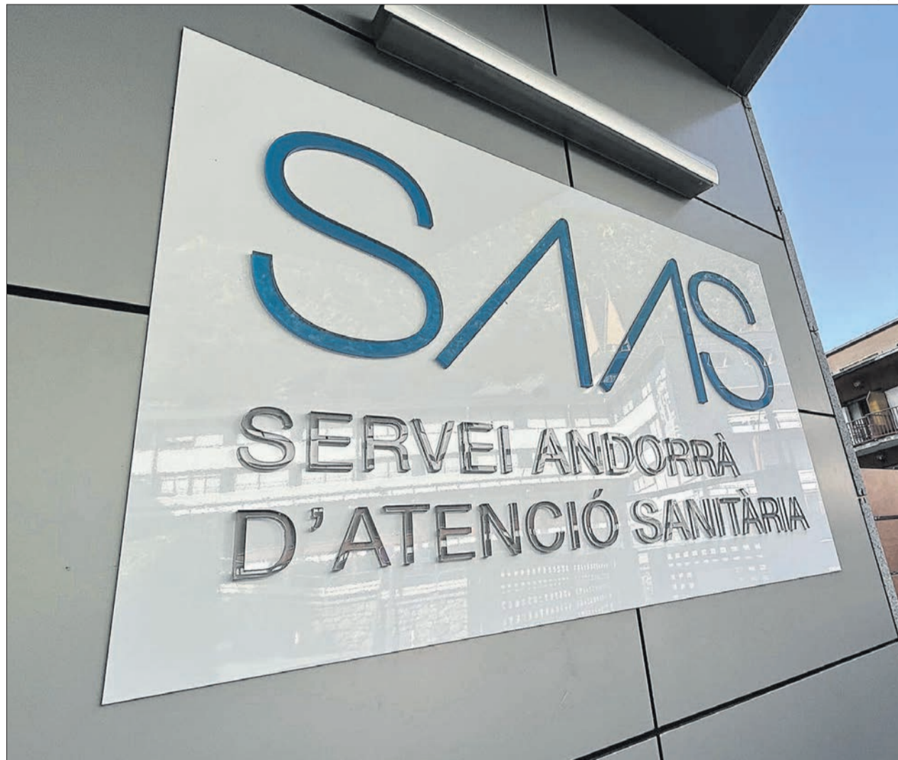
►► The Andorran Health Care Service.

The specialties with the most assignments are dermatology, cardiology and traumatology