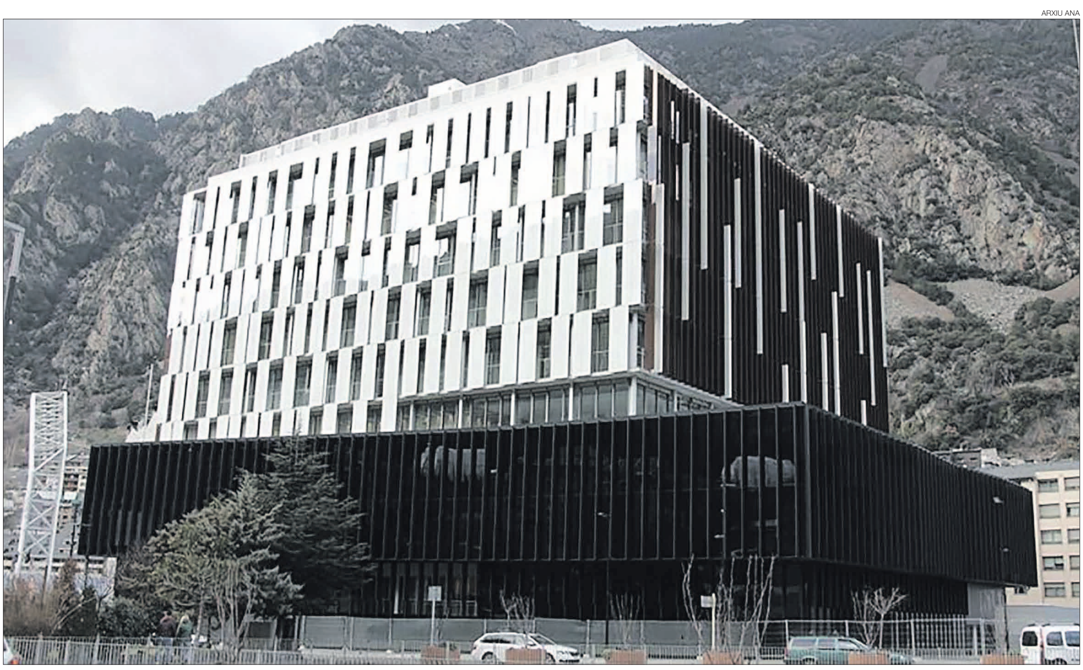
The Headquarters of Justice