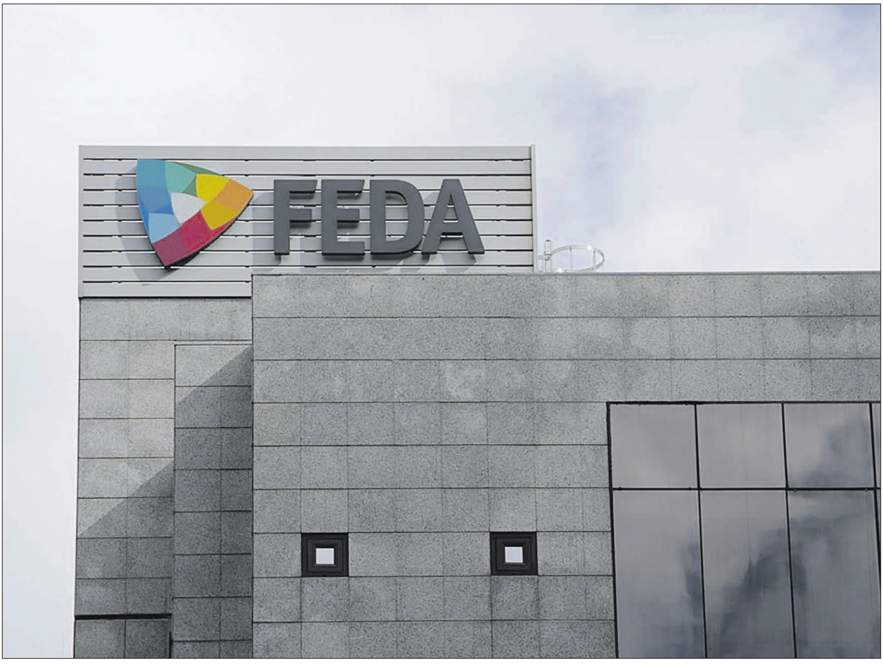
▶▶ The facilities of FEDA.

Energy consumption in tep \!/\!\!/\!\!/ On the other hand, energy consumption in the country during the month of November expressed in TEP was 16,363.3, which represents a positive percentage variation of 8.1% compared to November of 2022. From January to November of this year, consumption