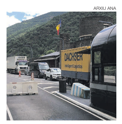
▶▶ The Hispano-Andorran border.

Regarding the volume of women and men employed in the large commercial areas, 64% corresponded to the female gender and the remaining 36% to the male gender, a distribution that shows great stability during the last 12 months. If we compare the data with the same period of the previous year, we can see that the proportion of women employed in this type of establishment fell by 2% in October. On the other hand, the proportion of men employed in large stores increased by 3.8% this same month. ≡