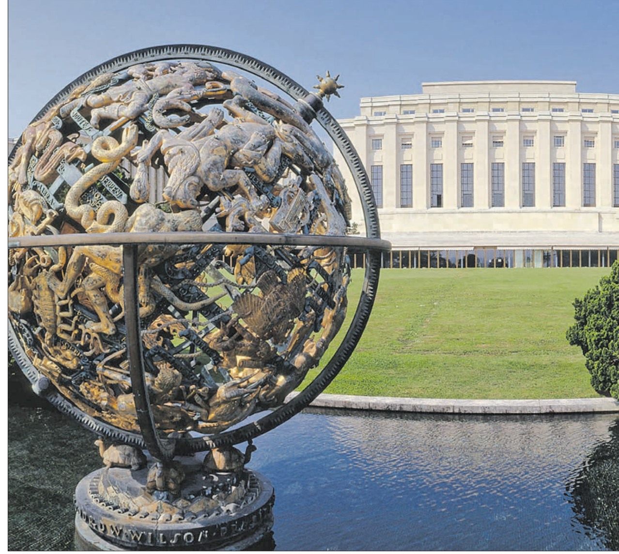
▶► Palace of Nations, office of the United Nations in the Swiss city of Geneva.

Mental Health and Education / Likewise, the Committee also noted «its concern about the lack of community-based mental health services and the internment of children with mental health problems in the Residential Center for Intensive Education or in therapeutic centers outside the Member State». Along these lines, the United Nations has recommended that Andorra carry out «a comprehensive study on the mental health of children, develop community-based mental health therapeutic services and counseling in schools and homes, and gradually abandon the practice of sending children with mental health problems and addictions in residential care centers».