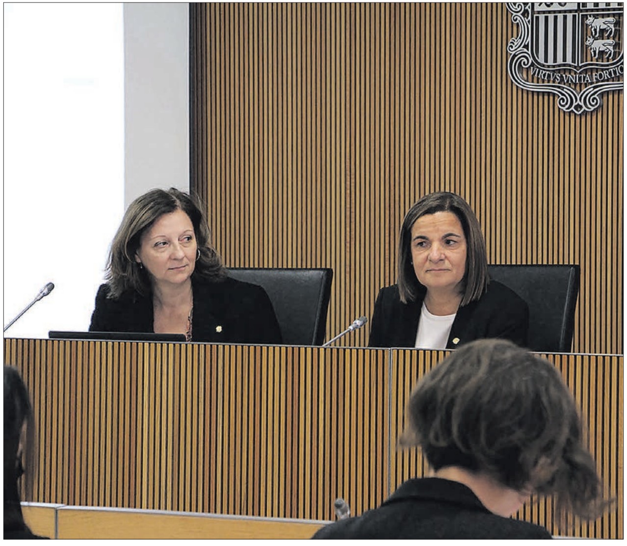
►► A moment of the appearance of the Minister of Social Affairs and Civil Service, Trini Marín.

On the other hand, one of the other projects that could reduce the waiting list is the day center in the parish of Escaldes-Engordany that will be inaugurated soon. Marín detailed that the nine people who are currently waiting to enter a day center will be covered and that there is also the possibility that some of the 18 people who are waiting for residence can also access the center's service. Despite the fact that waiting lists are answered with these resources, the minister empha-