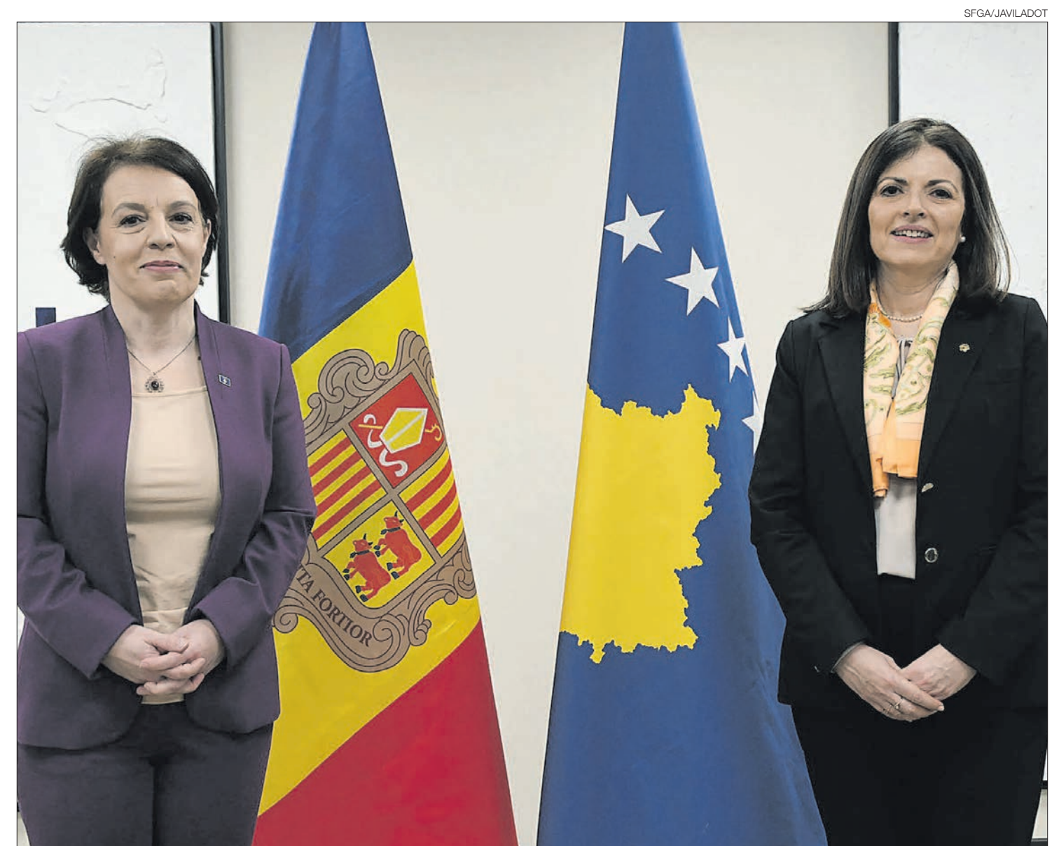
►► Meeting with the Deputy Prime Minister and Minister of Foreign Affairs, Donika Gërvalla-Schwarz.

Another topic that was touched upon during the Foreign Affairs working meeting was a possible accession of Kosovo as a full member of the International Organization of La Francophonie, although Tor pointed out that Kosovo has not filed his candidacy, but it intends to