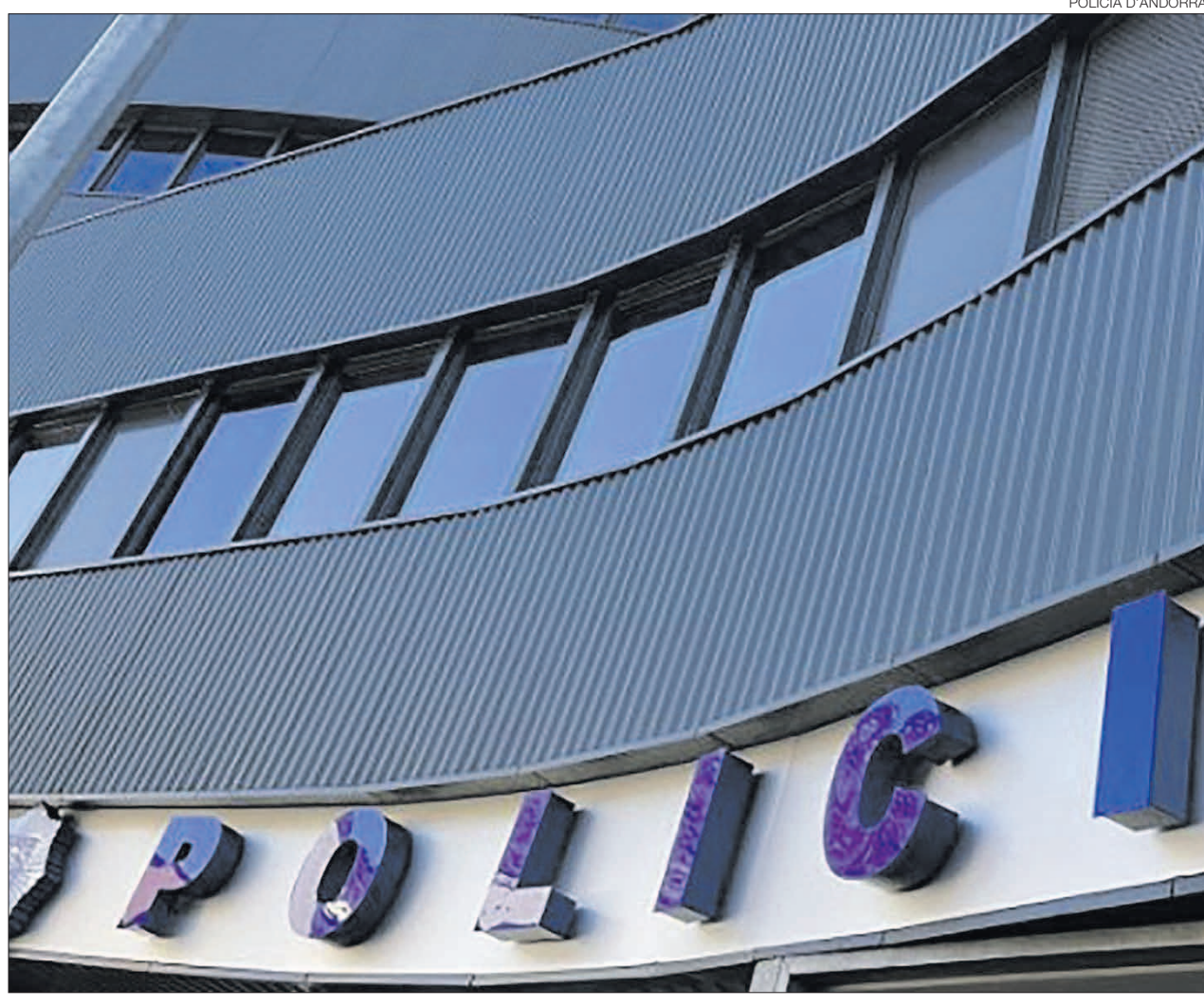
▶▶ Police administrative building.

On Friday, three more people were also arrested for drug possession. First, at 02.58 two male residents aged 19 and 21 were checked inside a night club in possession of 0.9 grams of cocaine. Later, at 04.10 hours, in a road control, the agents stopped a 34-year-old resident man while driving in a private car. He tested positive for breathalyzer with a rate of 0.96 g/l and, in addition, he was carrying