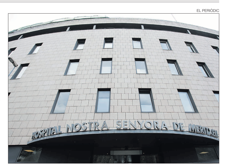
►► Archive image of the hospital.

On the other hand, the union pointed out that the reverse derivation is showing little adherence and effectiveness, despite the lack of official data. For this reason, the USdA argues that «the care and emergency management should assess additional measures». ≡