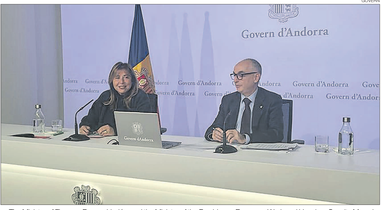
▶▶ The Minister of Finance, Ramon Lladós, and the Minister of the Presidency, Economy, Work and Housing, Conxita Marsol.