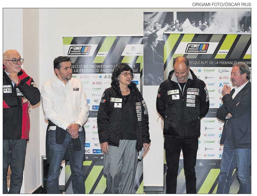
▶▶ The board of directors during the Christmas meeting.

Ski Federation celebrated the traditional Christmas Meeting last Wednesday afternoon at the Prat del Roure in Escaldes-Engordany, where all the athletes, coaches and sponsors of all sections of the FAE, in addition to public representatives. The attendees shared a moment in which the board of directors wished them a year 2024 full of success for everyone. \equiv