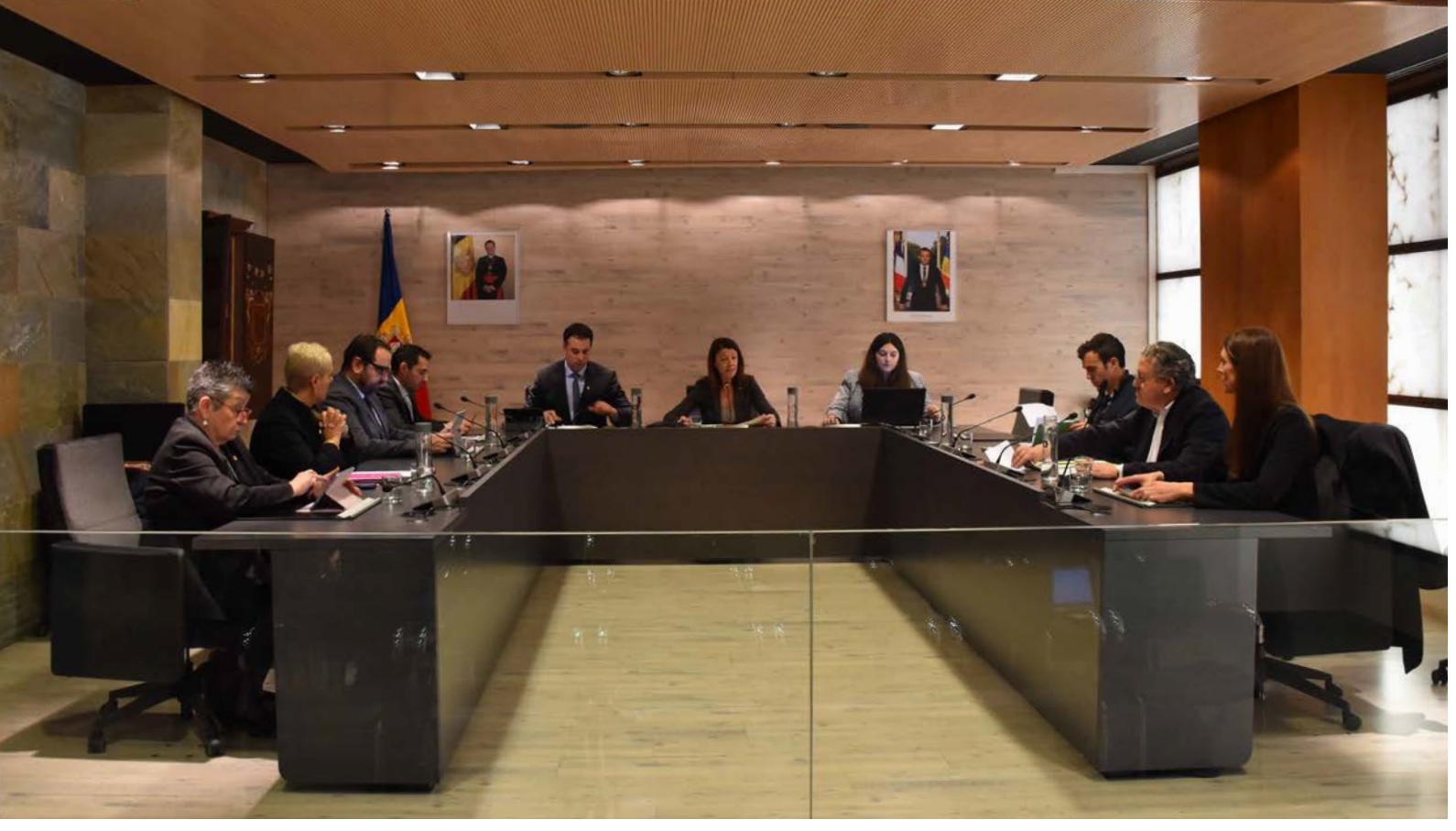
The councilors of Ordino during the Municipal council session.

Thus, everything seems to indicate that the municipal opposition will not be able to count on the letter from the owners until March 7th, a fact to which Dolsa was totally opposed: «The letter is not only addressed to the consuls, but also to the councilors and councilors of the Municipality. The-