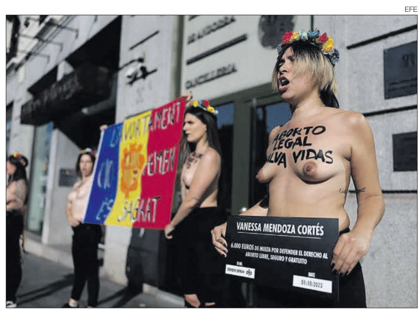
▶▶ Activists in front of the Andorran embassy, last Sunday.

The meeting brought together nearly a hundred dental specialists from all over the world. \equiv