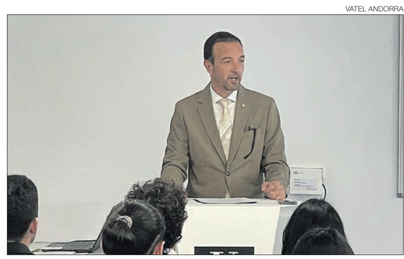
►► The Minister of Tourism and Commerce, Jordi Torres.