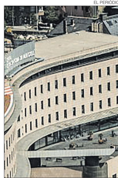
►► Hospital of Meritxell.

At the same time, the study also highlights the use and assistance of psychological services. Among people who are not currently in psychological treatment, a majority of 88% think they do not need it, compared to 11.5% who say they do. Finally, it should be noted that 14.5% of respondents who have minor sons and daughters say that one of their children is currently being treated for some psychological problem. ≡