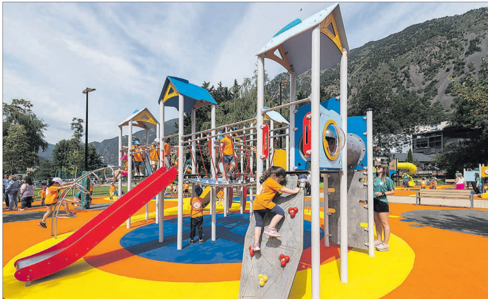
►► One of the new infrastructures of the Central Park play area.

SÒNIA LECHA ANDORRA LA VELLA @SoniaLecha