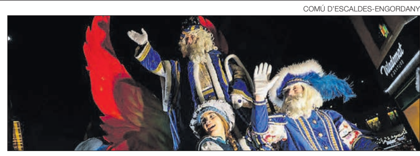
▶► Melchior greeting the little ones.

The selected children will be notified by telephone and must collect the corresponding clothing at the head office of the Pro-Tourism Union, located at Avinguda de les Escoles, 26, 1r 3a, in Escaldes-Engordany. A deposit of 30 euros must be left, which will be returned when the costume is returned. For the selection process, priority will be given to those children who have not participated on other occasions,