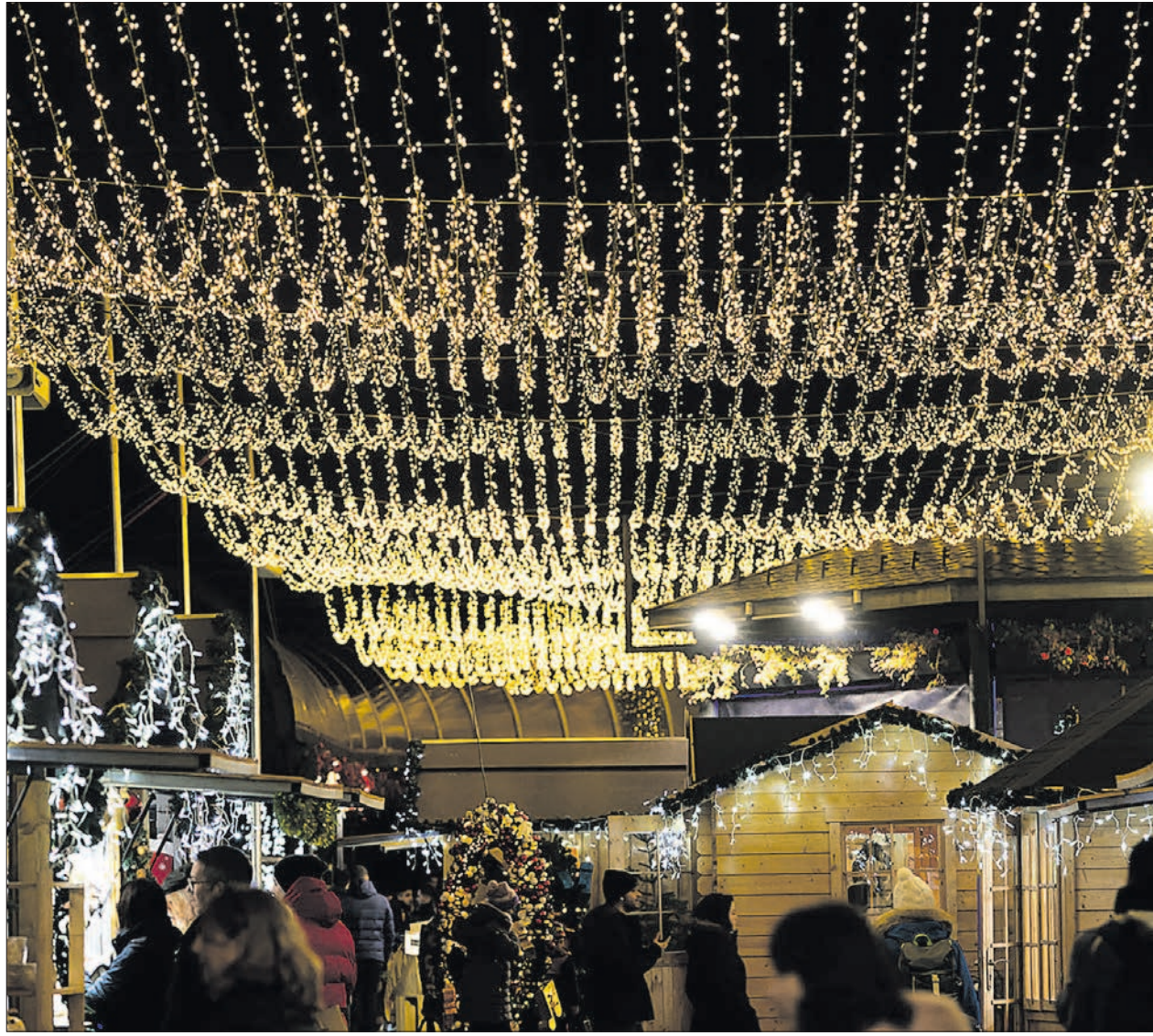
►► An image of last year's Christmas Village.

The Christmas village will be inaugurated on November 24th and, in addition to the traditional stalls in Plaça del Poble, there will again be proposals such as the carousel. Precisely, this Wednesday BOPA also published the award for the installation of this attraction, for an amount of 30,600 euros, to Gatzara Espectacles. The carousel itself will cost 23,500 euros and the sup-