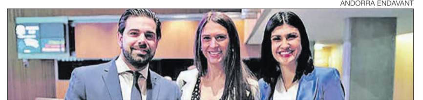
► The parliamentary group of Andorra Endavant.

and calls for a balancing of the budget items for the two infrastructure works. Then, the general counsel also suggests the creation of an aid to compensate for the loss of salary due to accompanying a minor child hospitalized or undergoing treatment outside of Andorra. The party defends this amendment of 1,000,000 euros, which would also be taken from Andorra Telecom, since they consider the four-day leave insufficient for a child with a serious illness in the event of an operation or others, and consider that the Government must compensate the salary of one of the