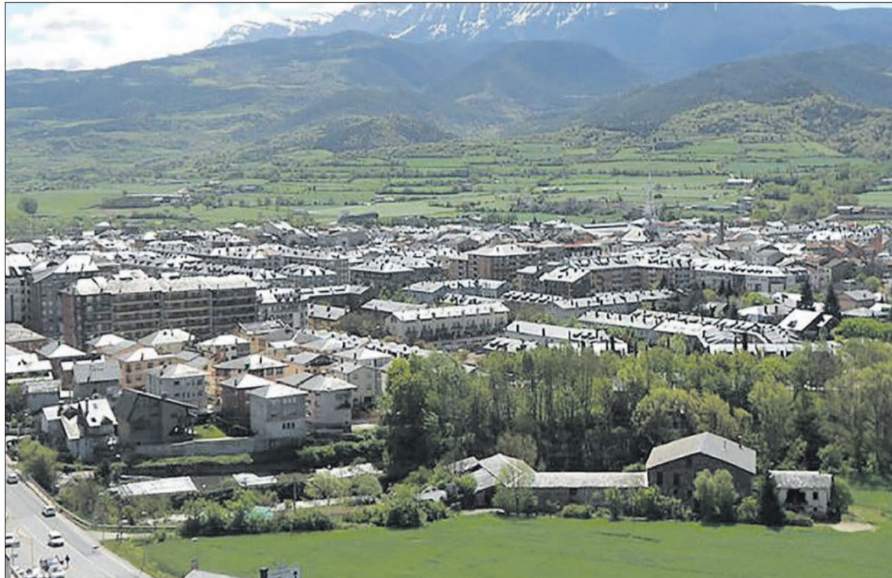
▶▶ Archive image of La Seu d'Urgell.