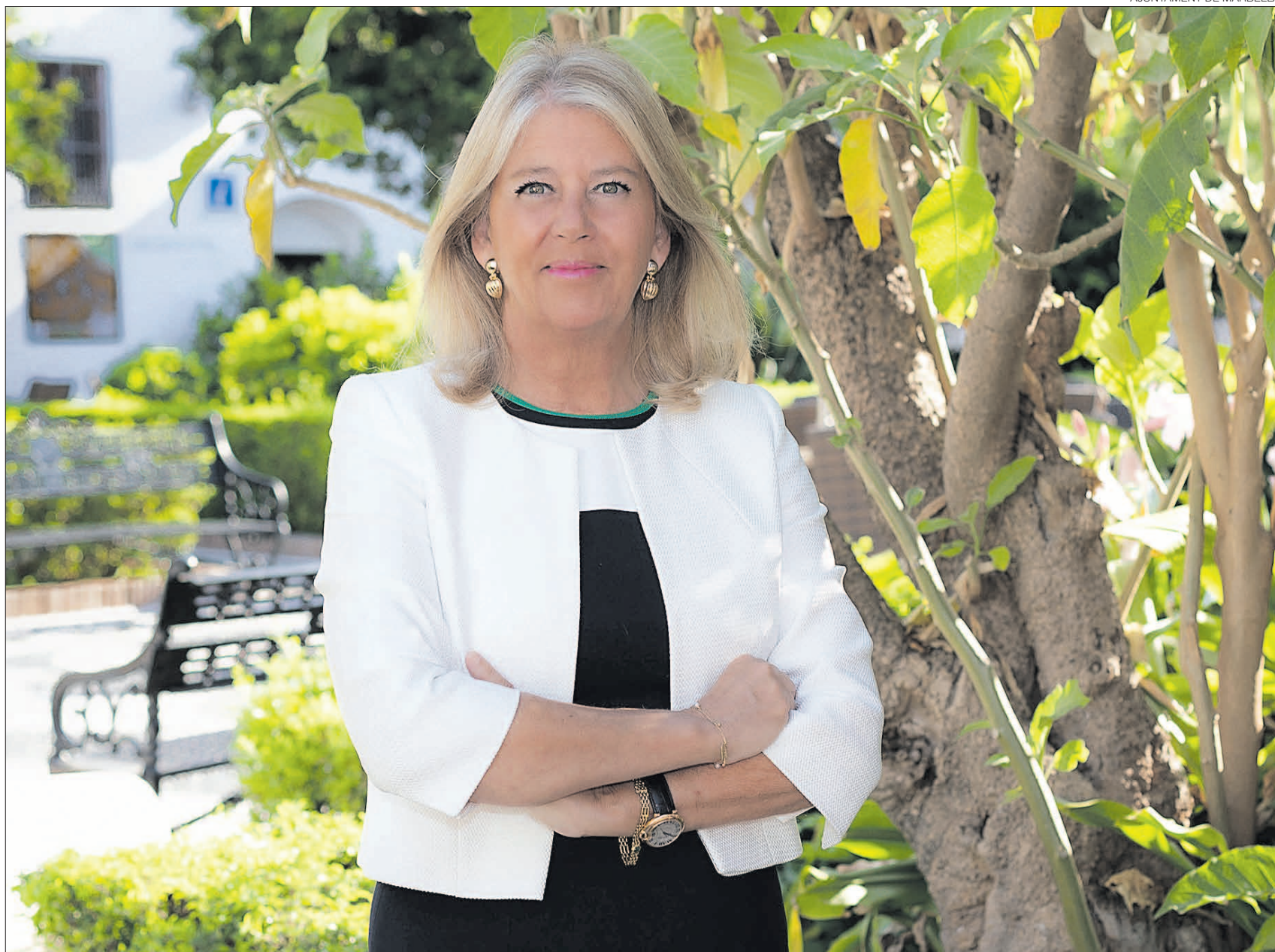
AJUNTAMENT DE MARBELLA

At the city council, we have been working and betting on reducing seasonality, and the results are very positive. We are also going to continue strengthening the Marbella brand at the national and international level, along with actions such as attending the main tourist fairs, such as Fitur in Madrid, World Travel Market in London and the ITB in Berlin, among many others. We will also campaign in markets such as America, Asia and, of course, the Arabian Peninsula, where we have had a great projection and an important relationship for many years.