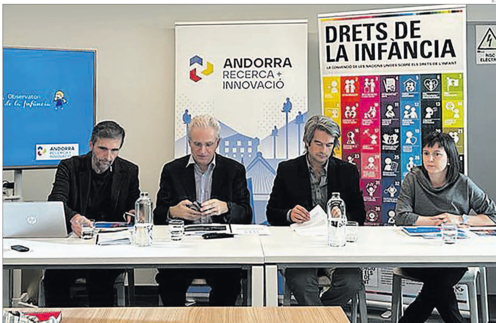
► The presentation of the Children's Observatory presented yesterday by AR+I and UNICEF.