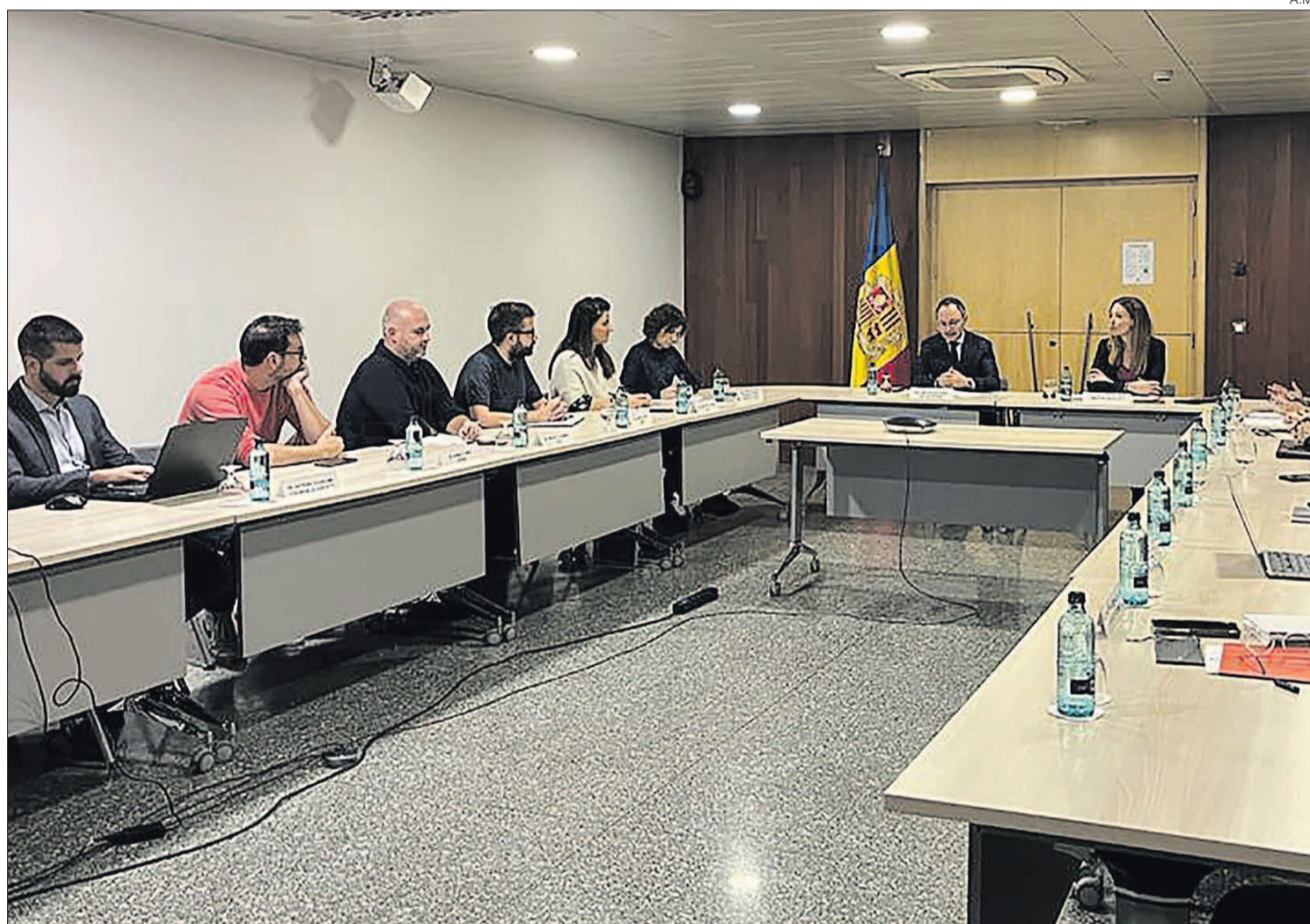
► A moment of the meeting to present the National Health Pact to the professional associations, the CASS and the SAAS.

During the meeting, the first draft of the text was presented, and Espot advanced that there is a whole series of reforms and evaluation processes in order to «see where it is, if it has been implemented correctly, if there has been some distortion that needs to be touched up or something