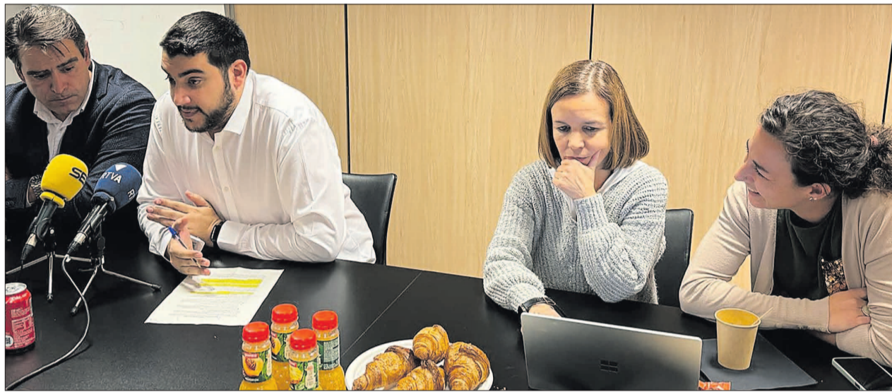
► La directiva socialdemòcrata, compareixent davant dels mitjans de comunicació.