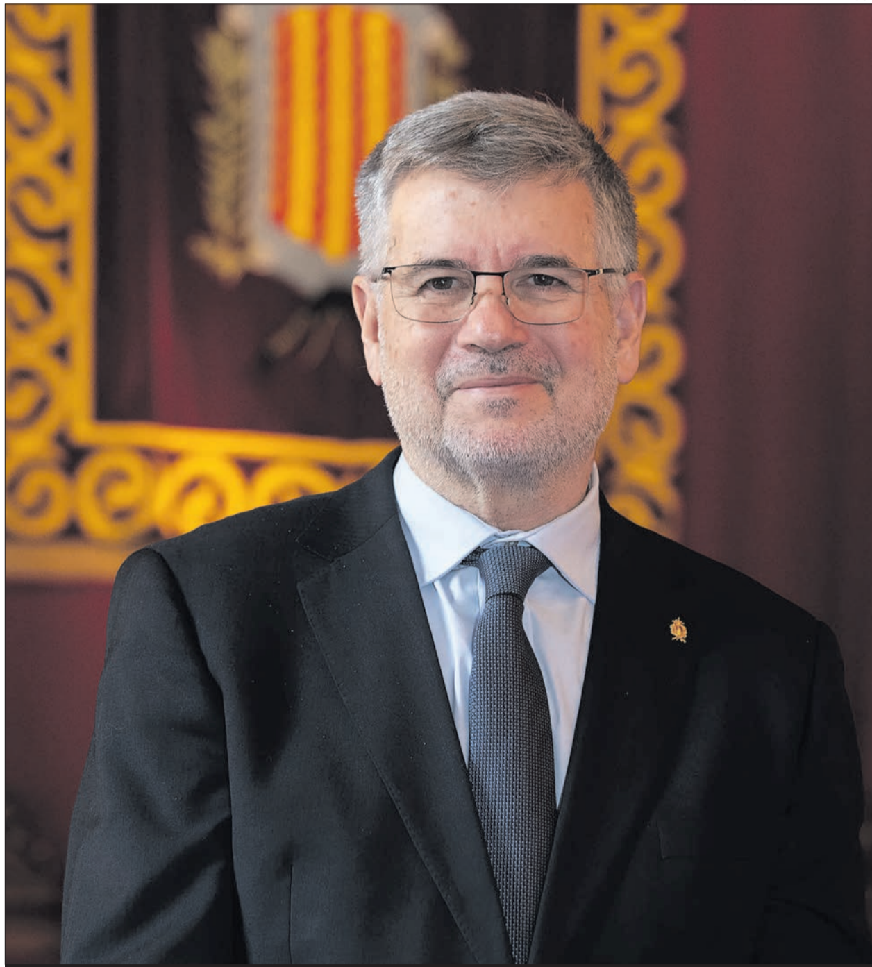
AJUNTAMENT DE TARRAGONA

–Tell us about the main city holidays and Catalan gastronomic traditions. Our highlight is romesco sauce,