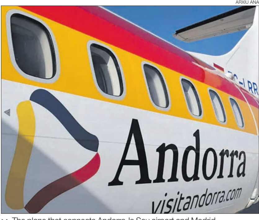
▶▶ The plane that connects Andorra-la Seu airport and Madrid.

vernment is a pilot test that aims to connect Andorra-la Seu airport with the Balearic Islands during the 2023-2024 winter season. The company will offer two flights, round trip, every Friday and every Sunday from January 5th to March 31st, making a total of 13 weeks of