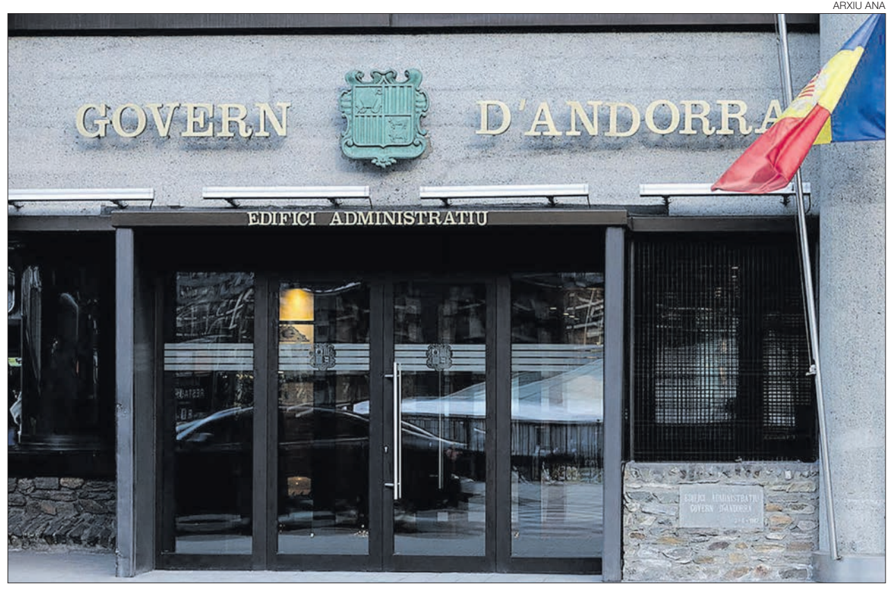
▶▶ The administrative building of the Government.

Therefore, the subjects obliged to comply with the code are the head of government and the ministers; as well as the high-ranking officials who are understood to be the holders of the General Secretariat of the Government and of the State Secretariats, the head of the Cabinet of the Head of Government and the head of Protocol. In addition, for the purposes of this text, ambassadors are assimilated to high positions while they are in charge of an embassy or a diplomatic mission, the heads of diplomatic missions and