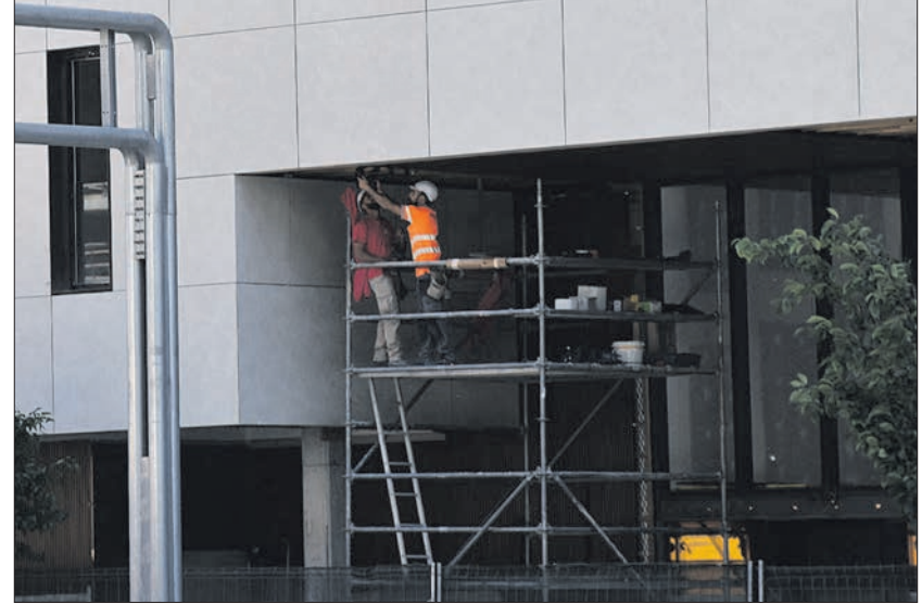
▶ Some workers.

The unemployment rate is 1.2% of the active population and counts 643 people between 15 and 74 years old. By gender, annually the unemployment rate decreases by 0.7 points for men and 1.5 points for women. \equiv