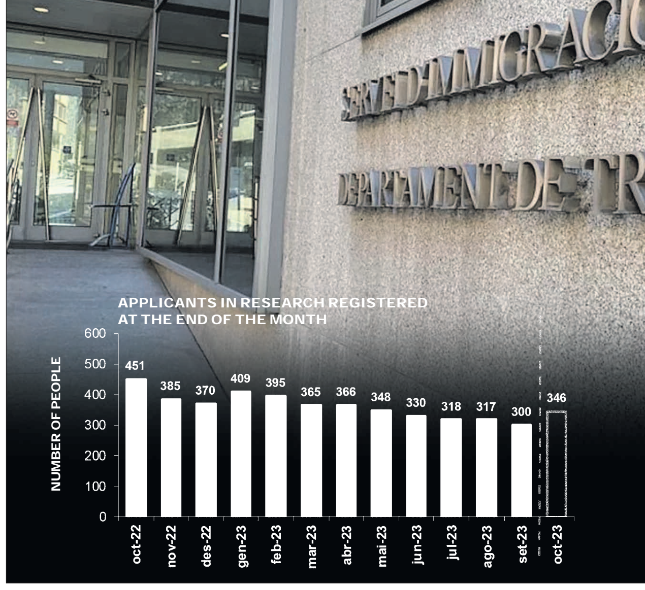
▶▶ The facade of the immigration service and a graphic about applicants looking for work.

The majority of applicants registered with the Employment Service who are looking for work (84.4%) have been unemployed for less than six months. 54.6% of those whose employment situation is improving have a temporary contract (discontinuous or seasonal contracts are included). By nationality and length of residence, the largest group are Spaniards with 10 years or more of