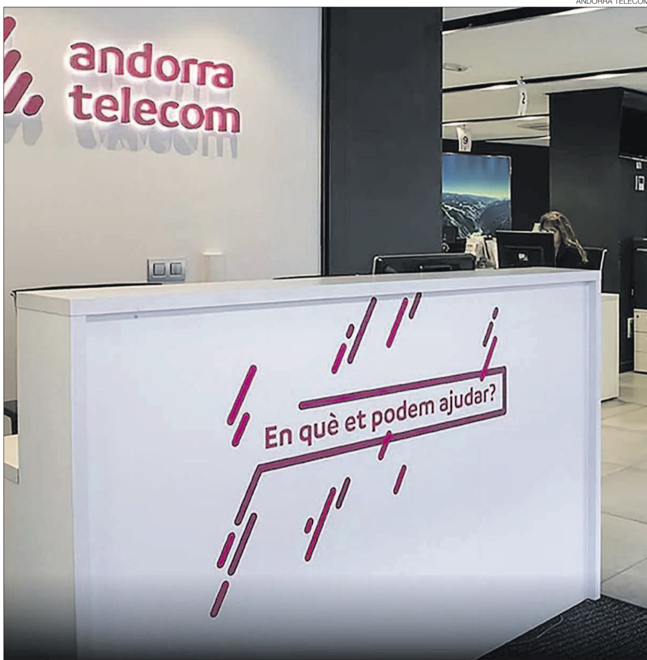
► The commercial office of Andorra Telecom.

It should also be noted that the telephone traffic in minutes without internet during the month of March stands at 14.47 million, equivalent to a decrease of 5.6%. With regard to national traffic, it was 9.61