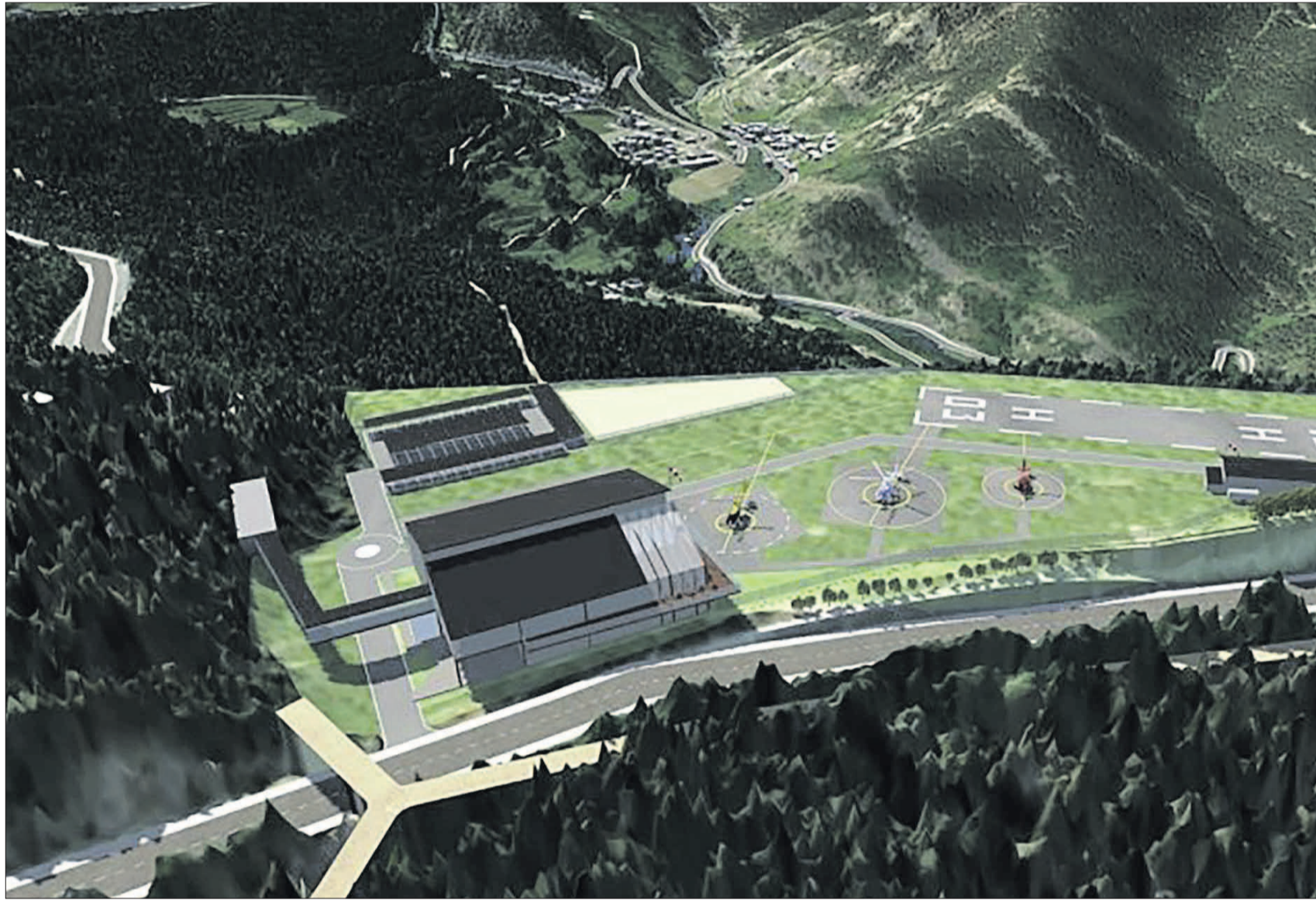
►► Rendering of the preliminary design of the Caubella National Heliport.

del Patapou. Then it was considered to be carried out in Escaldes-Engordany in the area of Tresoles, but the opposition of the neighbors caused the project to fall. Finally, the location where it has now been approved is the Caubella area.