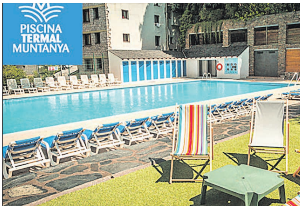
► From top to bottom: Els Serradells swimming pool in Andorra la Vella; La Mola outdoor pool in Encamp and Thermal Mountain pool in Escaldes-Engordany.

20.00 and on weekends from 10.00 to 20.00.