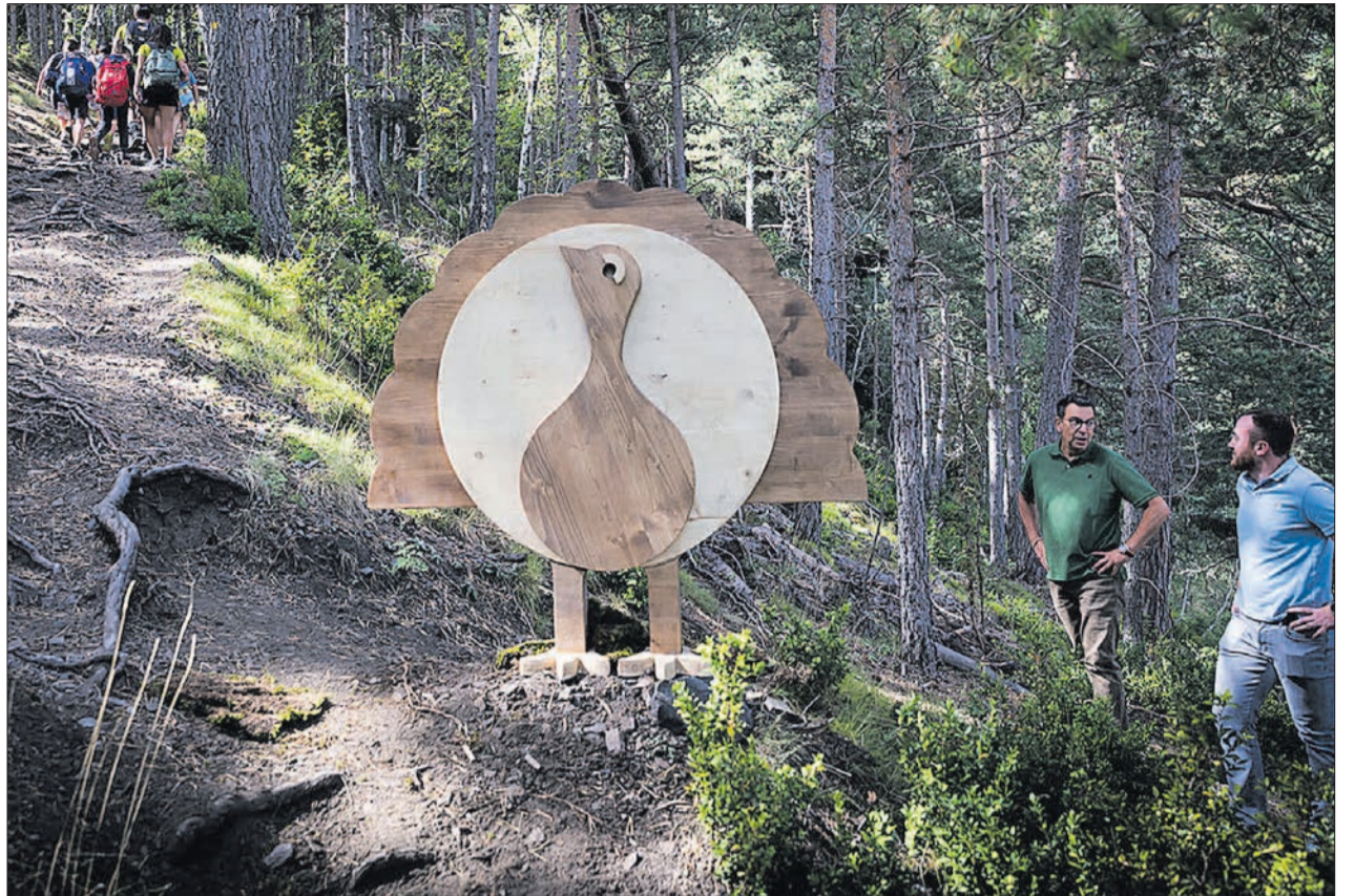
►► Presentation of the new route 'El bosc de l'Andy'.

«We wanted to bring young people closer to the most precious thing we have, nature. And if we can do this through artistic creation, even better»