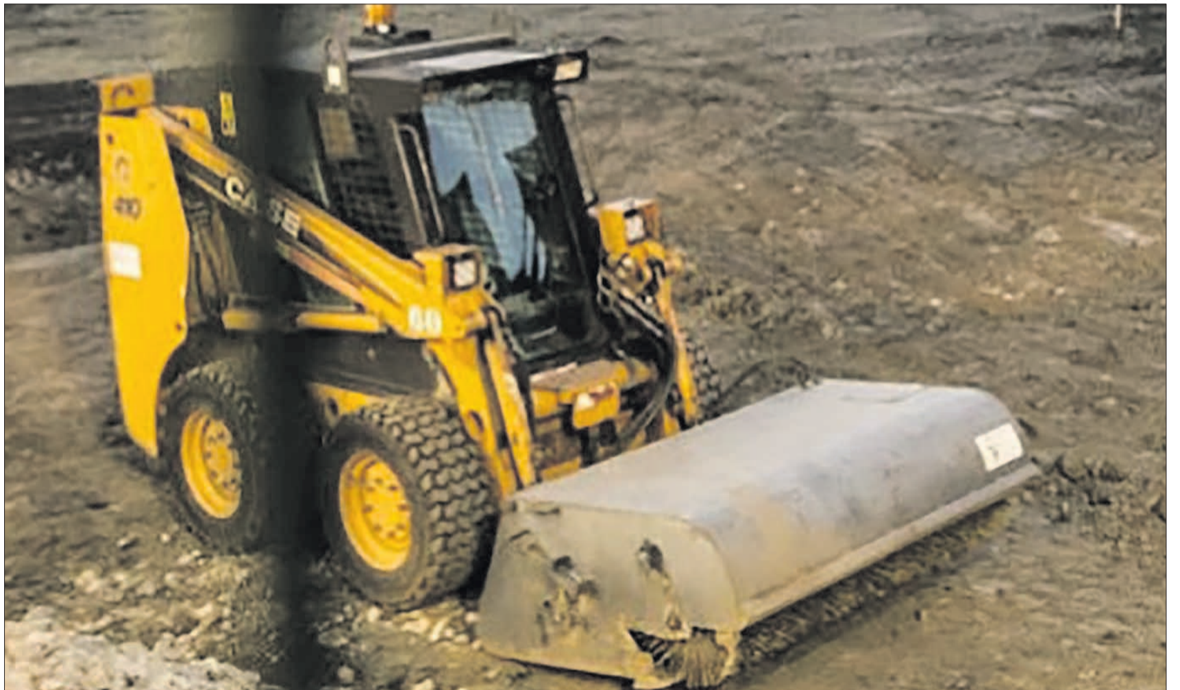
► Archive photo of some works in Andorra la Vella.

We remember that on Wednesday morning the Acting Minister of the Presidency, Economy and Business, Jordi Gallardo, met with the Minister of Justice and Interior, Josep Maria Rossell and the Minister of Territory and Housing, Víctor Filloy and the re-