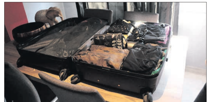
▶▶ Ana Tavares, an affected neighbor, pointing out the damage, a crack in the living room and her suitcase ready to leave.