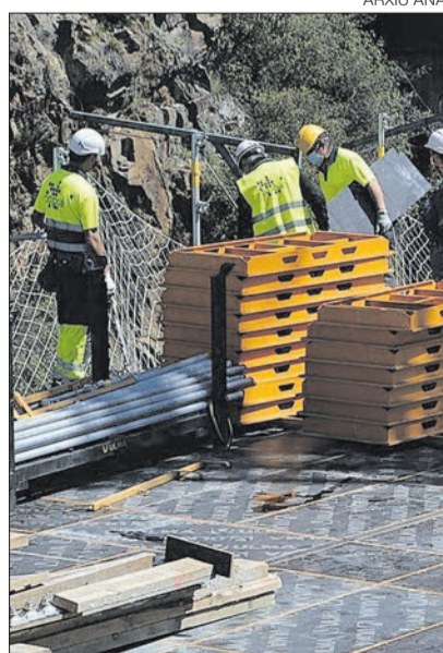
▶▶ Construction workers.

It should be noted that the number of employees during the same period was 41,588 people, which