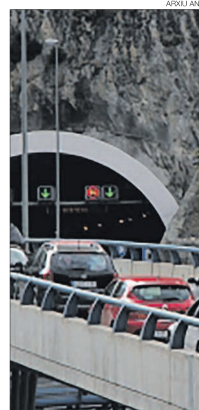
► Vehicles stopped in the tunnel.

According to the data published by the Department of Statistics, in cumulative terms of the last 12 months, visitors show an increase of 12.6% in relation to the same period of the previous year. Both tourists and hikers show increases of 16.9% and 9.5%, respectively. By country of residence, visitors from other ori-