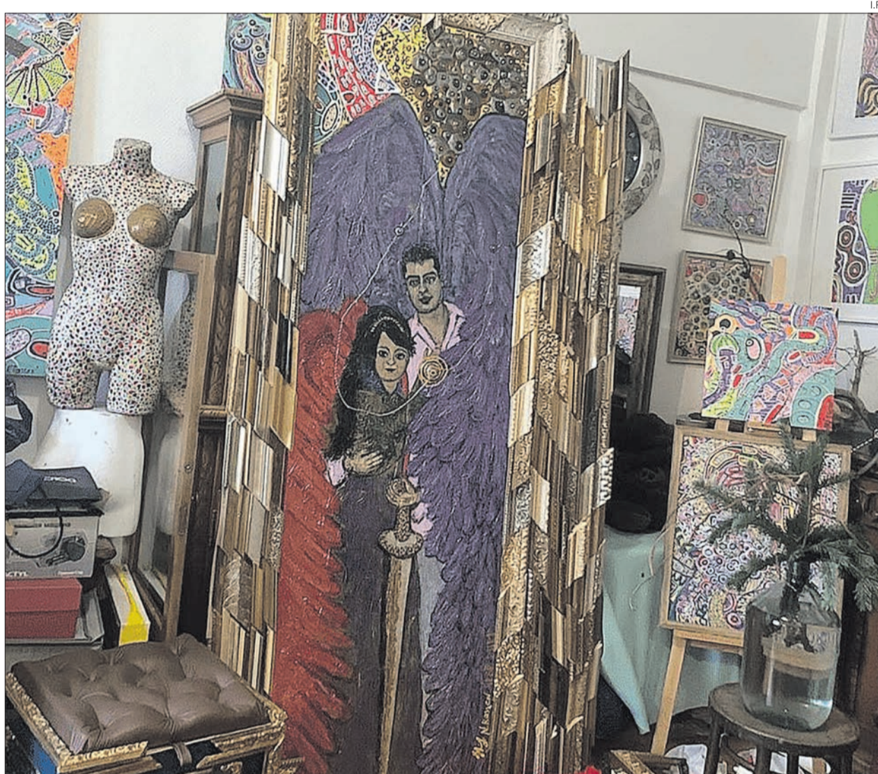
►► My last work «Pair of the World» was created on a huge wooden canvas. This is probably one of my biggest works to date and this is a museum work».

I have always had the idea of creating a World Fund for Helping Talented People. Earlier we announced this at one of our charity events together with the ambassadors of our project, and many famous talented people supported us.