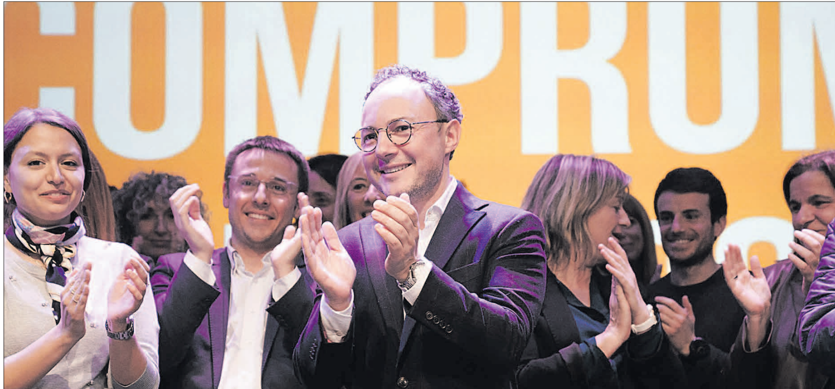
►► Xavier Esport and DA militants during the presentation of the lists for the 2A elections